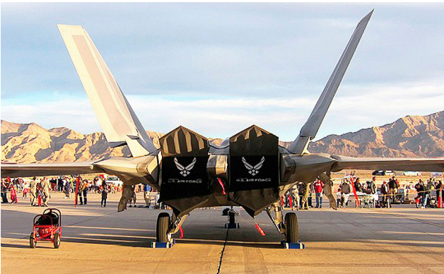
F22 Raptor Exhaust Plugs

The Engine Inlet Plugs are custom fit for your Lockheed Martin/Boeing F-22 Raptor intakes, made with heavy-duty vinyl material, and stuffed with a single block of sculpted urethane foam. Each plug has a zipper that allows the foam to be removed and dried if necessary. Engine plugs have 'remove before flight' streamers sewn onto the face of the plugs. Most plugs are imprinted with the aircraft registration number in black for an extra charge. Storage bag NOT included. Engine plugs may be inserted after flight when the engine is still warm. Engine Inlet Plugs are commonly referred to as Cowl Plugs, Intake Plugs, Cowl Blocks, Engine Blocks, and Engine Bungs.