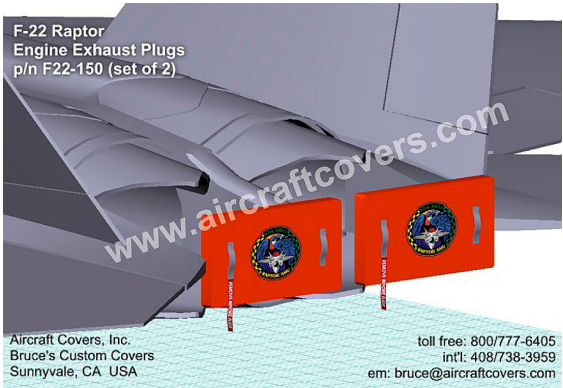
F-22 Exhaust Plugs, illustration