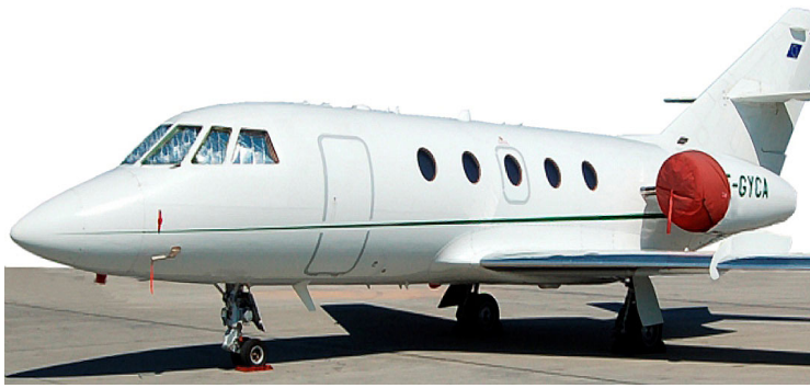
Falcon Engine Cover & Cockpit HeatShields