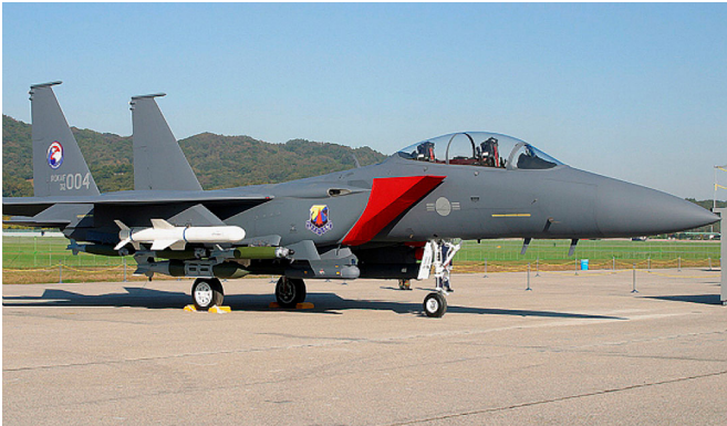
Intake Cover, F15-K