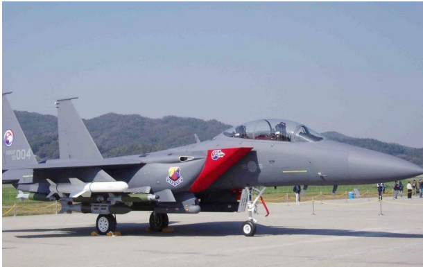
McDonnell Douglas F-15 Eagle Engine Inlet Covers

The McDonnell Douglas F-15 Eagle Intake Covers are designed to install easily yet be completely storable. A spring steel hoop is sewn into the hem of each cover, allowing them to be installed without climbing onto the wing or using a stepladder. To store the covers the spring steel hoop folds like a band-saw blade into three nesting rings. Each cover folds into a compact circular bundle which is stored in the included duffle bag, yet they unfold quickly for use. The Tri-Fold Ring cover is made of medium weight nylon which is available in a variety of colors to match the paint trim. Each cover set comes complete with installation and folding instructions. The aircraft's registration number can be silkscreened onto the cover for an extra charge.