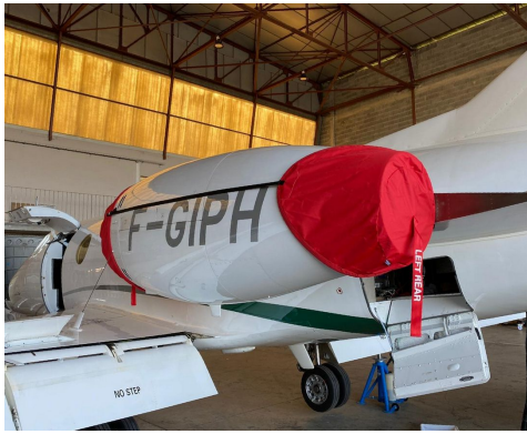
Falcon 10 Engine Covers, no TR's