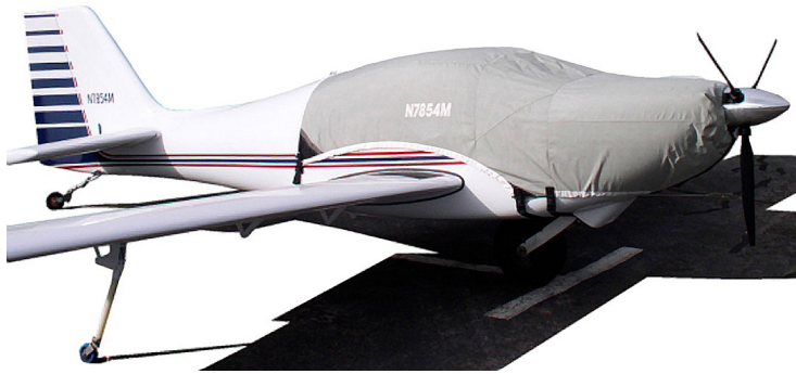
Europa Canopy/Engine Cover