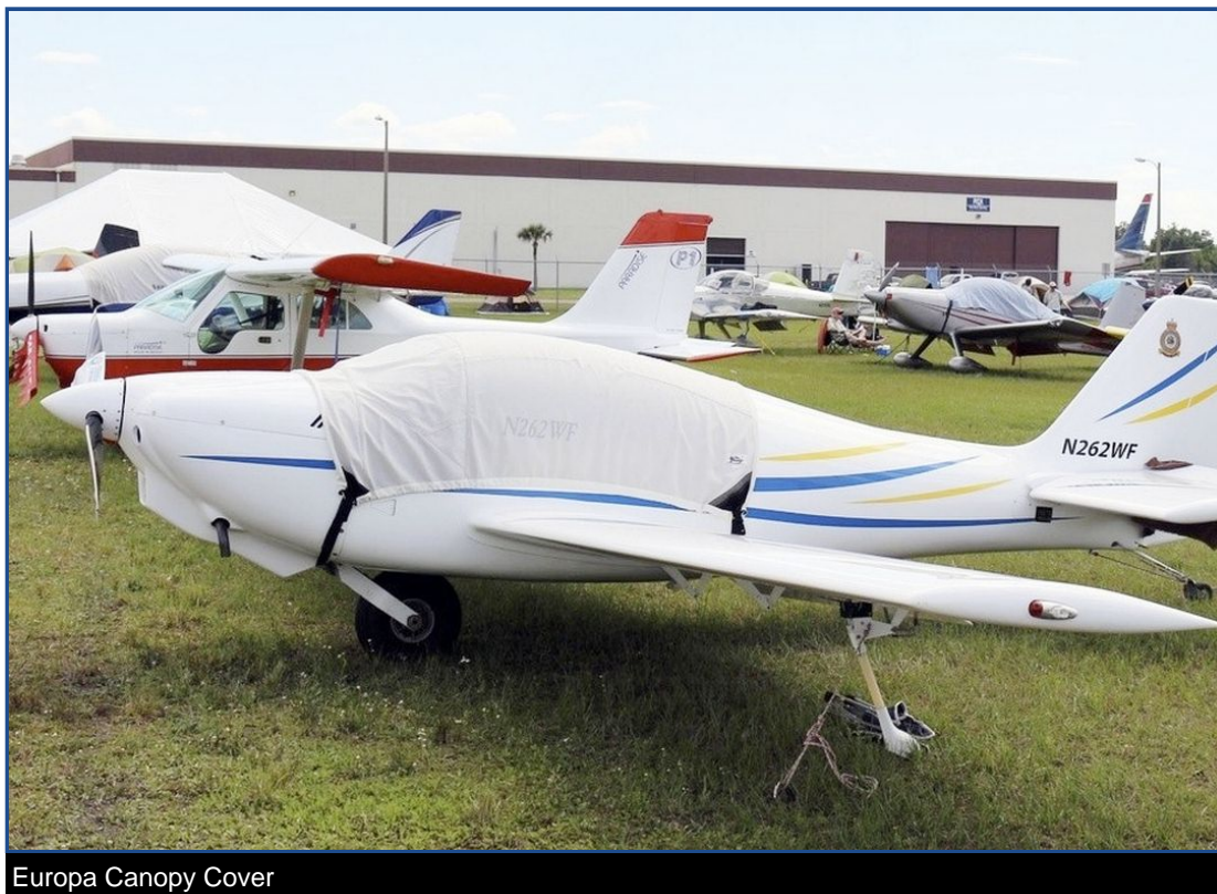
Europa Canopy Cover