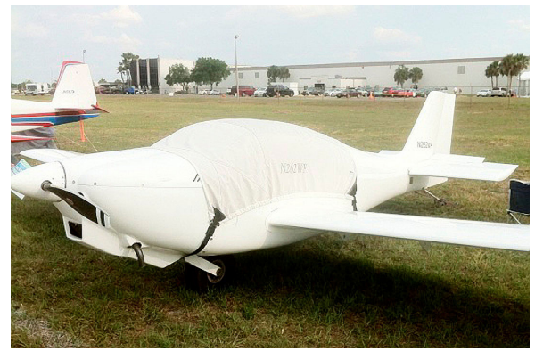
Europa XS Canopy Cover