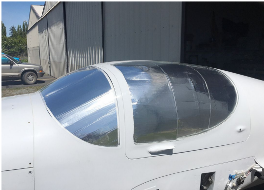
Europa Cabin HeatShields

Heatshields are interior sunshades for an aircraft's windows or canopy glass. The product is a unique composite of closed-cell foam with a silver mylar finish. The semi-rigid design is stiff enough to stand along the inside of the windshield using sun visors or window framing. It folds up flat and easily stores in the included storage sleeve. Some designs may require velcro and suction cups. A Heatshield is an excellent short-term remedy for cockpit overheating.