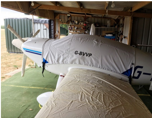
Europa Canopy Cover