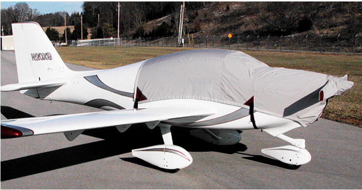
Canopy/Engine and Prop/Spinner Covers (tri-gear model)

This cover type is made from Silver Acrylic Sunbrella canvas and is 100% lined with a soft and smooth microfiber. Bruce's Custom Covers developed this material combination especially for aircraft protection. The outer material is medium weight and treated for water resistance, UV resistance and anti-static buildup. The inner lining is a very soft and smooth microfiber to prevent scratching. The material is very reflective, and tests show that the cabin interior temperature can be reduced to near-ambient temperature on the hottest of days. It is water, ice and snow repellent, yet breathable to allow moisture to escape from between the cover and the aircraft surface.