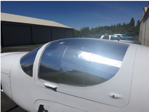
Europa Cabin HeatShields