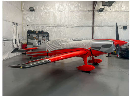
Extra NG Canopy Cover, single place model