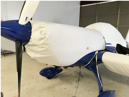
Extra 300, 330SC & 200/230 Models Engine Cover

This cover type is made from Silver Acrylic Sunbrella canvas and is 100% lined with a soft and smooth microfiber. Bruce's Custom Covers developed this material combination especially for aircraft protection. The outer material is medium weight and treated for water resistance, UV resistance and anti-static buildup. The inner lining is a very soft and smooth microfiber to prevent scratching. The material is very reflective, and tests show that the cabin interior temperature can be reduced to near-ambient temperature on the hottest of days. It is water, ice and snow repellent, yet breathable to allow moisture to escape from between the cover and the aircraft surface.