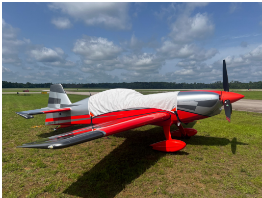
Extra NG Canopy Cover, Single Place Canopy

This cover type is made from Silver Acrylic Sunbrella canvas and is 100% lined with a soft and smooth microfiber. Bruce's Custom Covers developed this material combination especially for aircraft protection. The outer material is medium weight and treated for water resistance, UV resistance and anti-static buildup. The inner lining is a very soft and smooth microfiber to prevent scratching. The material is very reflective, and tests show that the cabin interior temperature can be reduced to near-ambient temperature on the hottest of days. It is water, ice and snow repellent, yet breathable to allow moisture to escape from between the cover and the aircraft surface.