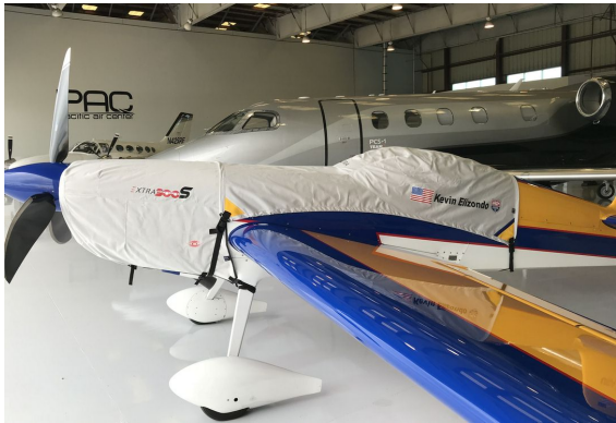
Extra 300S Canopy & Engine Covers