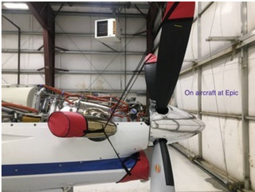
Epic Aircraft Prop Tie, Exhaust & Intake Covers

This cover type is made from Silver Acrylic Sunbrella canvas and is 100% lined with a soft and smooth microfiber. Bruce's Custom Covers developed this material combination especially for aircraft protection. The outer material is medium weight and treated for water resistance, UV resistance and anti-static buildup. The inner lining is a very soft and smooth microfiber to prevent scratching. The material is very reflective, and tests show that the cabin interior temperature can be reduced to near-ambient temperature on the hottest of days. It is water, ice and snow repellent, yet breathable to allow moisture to escape from between the cover and the aircraft surface.