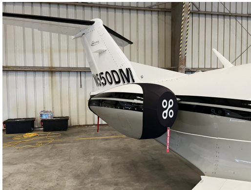
Eclipse Engine Covers, Bikini Type

The Eclipse EA500, TE500, 550 Bikini Style Engine Covers are a single-piece design using a soft and smooth stretchy fabric. The cover stretches tightly over both the intake and exhaust, installing quickly and easily. These covers are designed to be used as hangar dust covers and have a useful life of approximately one year.