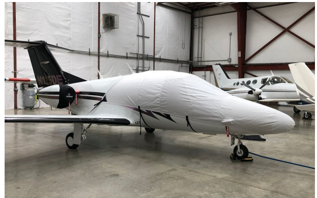
Eclipse EA500 Canopy/Nose Cover, Engine Covers