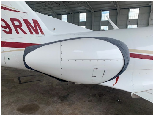
Engine Cover Wraps

The Eclipse EA500, TE500, 550 Bikini Style Engine Covers are a single-piece design using a soft and smooth stretchy and fabric. The cover stretches tightly over both the intake and exhaust, installing quickly and easily. These covers are designed to be used as hangar dust covers and have a useful life of approximately one year.