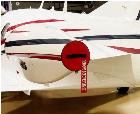
Eclipse EA500 Intake/Exhaust Plugs

necessary. Engine plugs have 'remove before flight' streamers sewn onto the face of the plugs. Most plugs are imprinted with the aircraft registration number in black for an extra charge. Storage bag NOT included. Engine plugs may be inserted after flight when the engine is still warm. Engine Inlet Plugs are commonly referred to as Cowl Plugs, Intake Plugs, Cowl Blocks, Engine Blocks, and Engine Bunges.