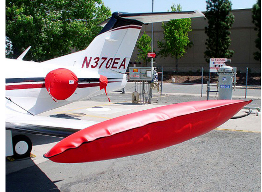
Eclipse Tip Tank & Engine Covers