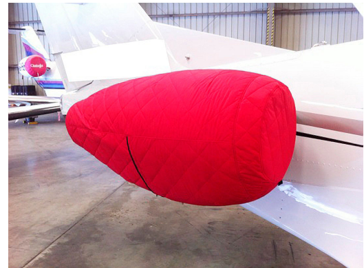
Eclipse Insulated Engine Cover