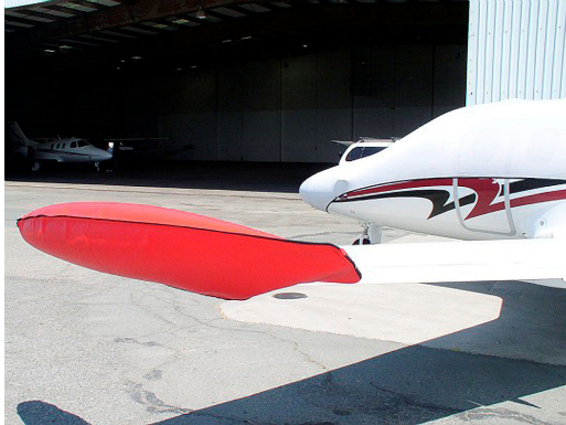
Eclipse Tip Tank Cover

Designed to prevent damage to the aircraft extremities in crowded hangars, these products are made of bright red Naugahyde and thickly padded with a sandwich of closed cell foam. Nowadays they are also made using bright red Neoprene padded laminated (think: wetsuit material).