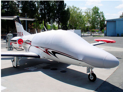
Eclipse Light Weight Travel Cover & Engine Plugs

This cover type is made from Silver Acrylic Sunbrella canvas and is 100% lined with a soft and smooth microfiber. Bruce's Custom Covers developed this material combination especially for aircraft protection. The outer material is medium weight and treated for water resistance, UV resistance and anti-static buildup. The inner lining is a very soft and smooth microfiber to prevent scratching. The material is very reflective, and tests show that the cabin interior temperature can be reduced to near-ambient temperature on the hottest of days. It is water, ice and snow repellent, yet breathable to allow moisture to escape from between the cover and the aircraft surface.