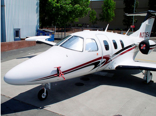
Eclipse Pitot Cover & Bikini Type Engine Covers

Cockpit Heatshields are interior sunshades for the aircraft's cockpit. The product is a unique composite of closed-cell foam with a silver mylar finish. The semi-rigid design is stiff enough to stand inside the window framing. The set folds up flat and is easily stored in the included storage sleeve. Some designs may require velcro and suction cups. Our Heatshields for jets are offered white side out because some aircraft manufacturers have issued advisories against reflective window inserts due to potential heat damage. A Heatshield is an excellent short-term remedy for cockpit overheating, but an external fabric cover is more effective for long-term protection.