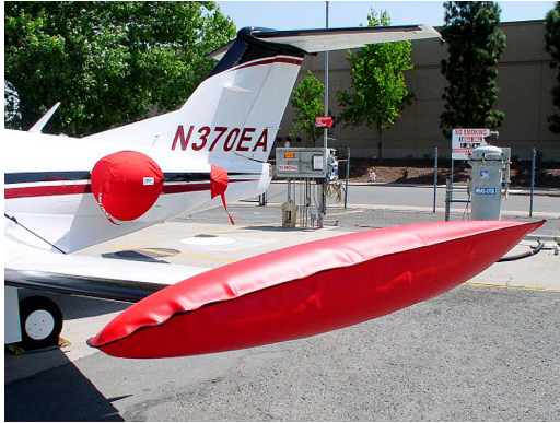
Eclipse Tip Tank & Engine Covers

Designed to prevent damage to the aircraft extremities in crowded hangars, these products are made of bright red Naugahyde and thickly padded with a sandwich of closed cell foam.