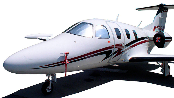
Cockpit HeatShields, Pitot Covers & "Bikini" style Engine Covers