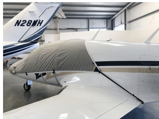
Eclipse EA500 Travel Weight Canopy/Nose Cover