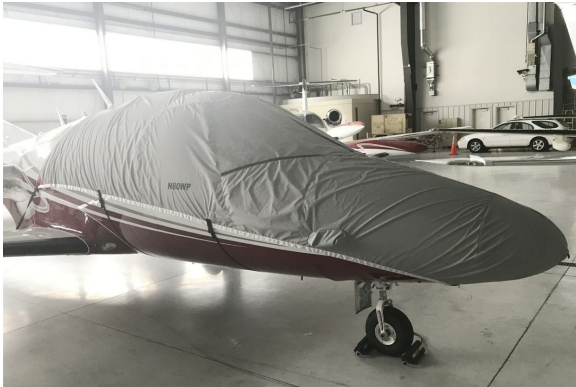
Eclipse EA550 Travel Canopy/Nose Cover