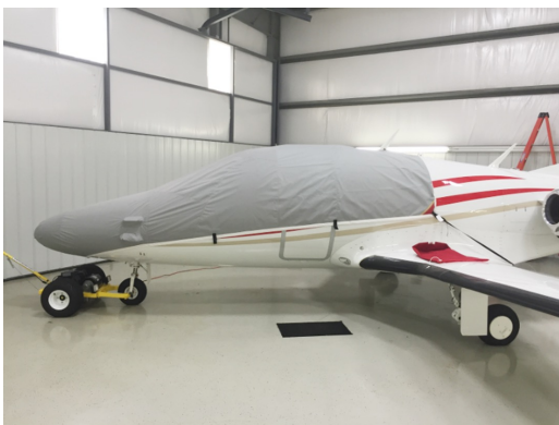
Eclipse Travel Weight Canopy/Nose Cover

This cover type is made from Silver Acrylic Sunbrella canvas and is 100% lined with a soft and smooth microfiber. Bruce's Custom Covers developed this material combination especially for aircraft protection. The outer material is medium weight and treated for water resistance, UV resistance and anti-static buildup. The inner lining is a very soft and smooth microfiber to prevent scratching. The material is very reflective, and tests show that the cabin interior temperature can be reduced to near-ambient temperature on the hottest of days. It is water, ice and snow repellent, yet breathable to allow moisture to escape from between the cover and the aircraft surface.