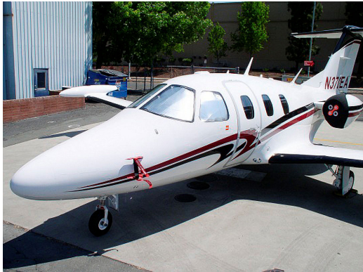
Eclipse Pitot Cover & Bikini Type Engine Covers

Cockpit Heatshields are interior sunshades for the aircraft's cockpit. The product is a unique composite of closed-cell foam with a silver mylar finish. The semi-rigid design is stiff enough to stand inside the window framing. The set folds up flat and is easily stored in the included storage sleeve. Some designs may require velcro and suction cups. Our Heatshields for jets are offered white side out because some aircraft manufacturers have issued advisories against reflective window inserts due to potential heat damage. A Heatshield is an excellent short-term remedy for cockpit overheating, but an external fabric cover is more effective for long-term protection.