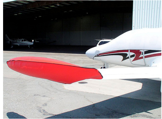
Eclipse Tip Tank Cover