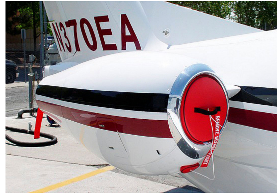
Eclipse Engine Inlet Plugs set