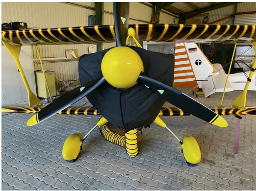
Christen Eagle Insulated Engine Cover

the hottest of days. It is water, ice and snow repellent, yet breathable to allow moisture to escape from between the cover and the aircraft surface.