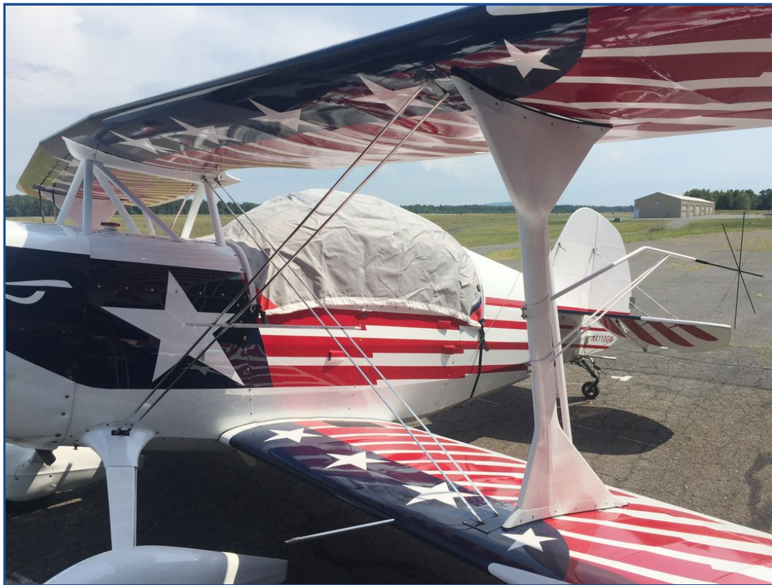
Christen Eagle Light Weight Travel Canopy Cover