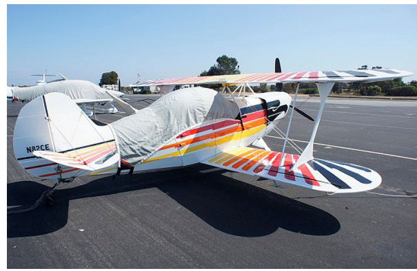
Eagle Canopy Cover, with extension to tail