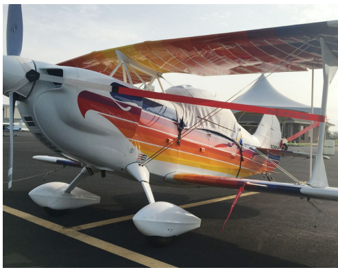
Christen Eagle Canopy Cover