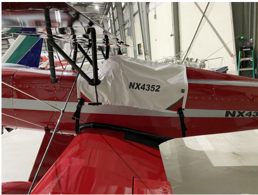
EAA Acro Sport Canopy Cover

the hottest of days. It is water, ice and snow repellent, yet breathable to allow moisture to escape from between the cover and the aircraft surface.