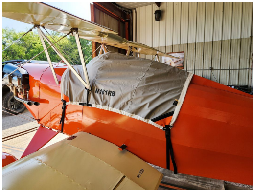
Burt Special Canopy Cover