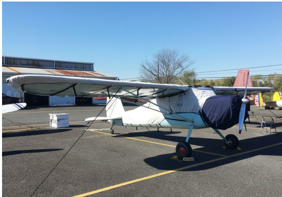
Cessna 140 Insulated Engine, Canopy, Empennage & Wing Covers Cessna 140 Canopy, Engine, Wing & Empennage Covers