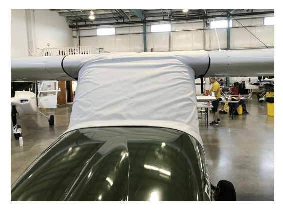
Vashon Ranger R7 Canopy Cover

This cover type is made from Silver Acrylic Sunbrella canvas and is 100% lined with a soft and smooth microfiber. Bruce's Custom Covers developed this material combination especially for aircraft protection. The outer material is medium weight and treated for water resistance, UV resistance and anti-static buildup. The inner lining is a very soft and smooth microfiber to prevent scratching. The material is very reflective, and tests show that the cabin interior temperature can be reduced to near-ambient temperature on the hottest of days. It is water, ice and snow repellent, yet breathable to allow moisture to escape from between the cover and the aircraft surface.