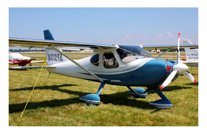
Glastar Sportsman Engine Inlet Plugs