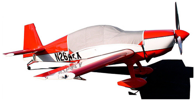
Canopy Cover for the Extra 300