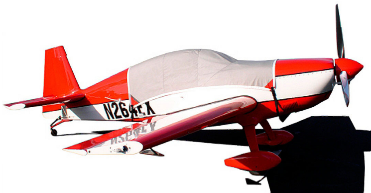
Canopy Cover for the Extra 300