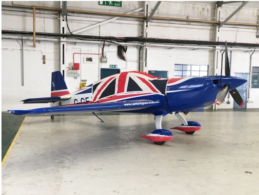
Extra 330 Canopy Cover, custom design

water resistance, UV resistance and anti-static buildup. The inner lining is a very soft and smooth microfiber to prevent scratching. The material is very reflective, and tests show that the cabin interior temperature can be reduced to near-ambient temperature on the hottest of days. It is water, ice and snow repellent, yet breathable to allow moisture to escape from between the cover and the aircraft surface.