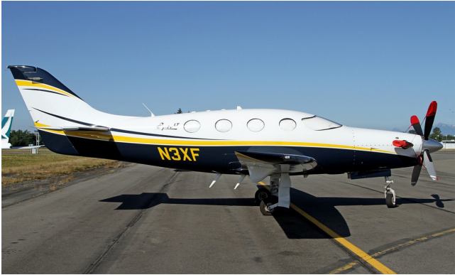
Epic LT Cockpit & Cabin HeatShields

This cover type is made from Silver Acrylic Sunbrella canvas and is 100% lined with a soft and smooth microfiber. Bruce's Custom Covers developed this material combination especially for aircraft protection. The outer material is medium weight and treated for water resistance, UV resistance and anti-static buildup. The inner lining is a very soft and smooth microfiber to prevent scratching. The material is very reflective, and tests show that the cabin interior temperature can be reduced to near-ambient temperature on the hottest of days. It is water, ice and snow repellent, yet breathable to allow moisture to escape from between the cover and the aircraft surface.