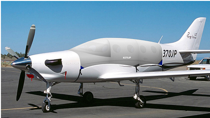
Epic LT Canopy Cover & Engine Plugs

This cover type is made from Silver Acrylic Sunbrella canvas and is 100% lined with a soft and smooth microfiber. Bruce's Custom Covers developed this material combination especially for aircraft protection. The outer material is medium weight and treated for water resistance, UV resistance and anti-static buildup. The inner lining is a very soft and smooth microfiber to prevent scratching. The material is very reflective, and tests show that the cabin interior temperature can be reduced to near-ambient temperature on the hottest of days. It is water, ice and snow repellent, yet breathable to allow moisture to escape from between the cover and the aircraft surface.