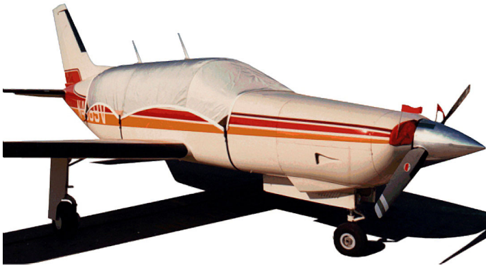
Malibu/Mirage/Meridian Standard Canopy Cover