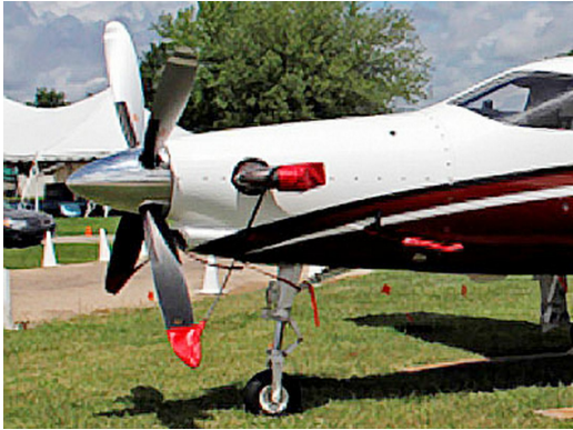
Epic Prop Tie-down/Exhaust cover set