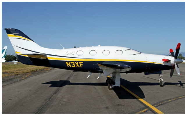
Epic LT Cockpit & Cabin HeatShields