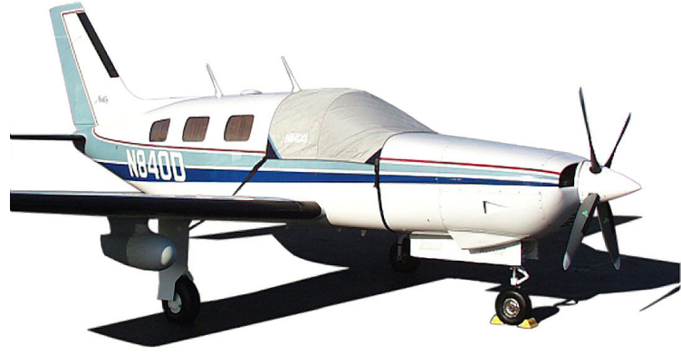
Piper Malibu/Mirage Windshield Cover