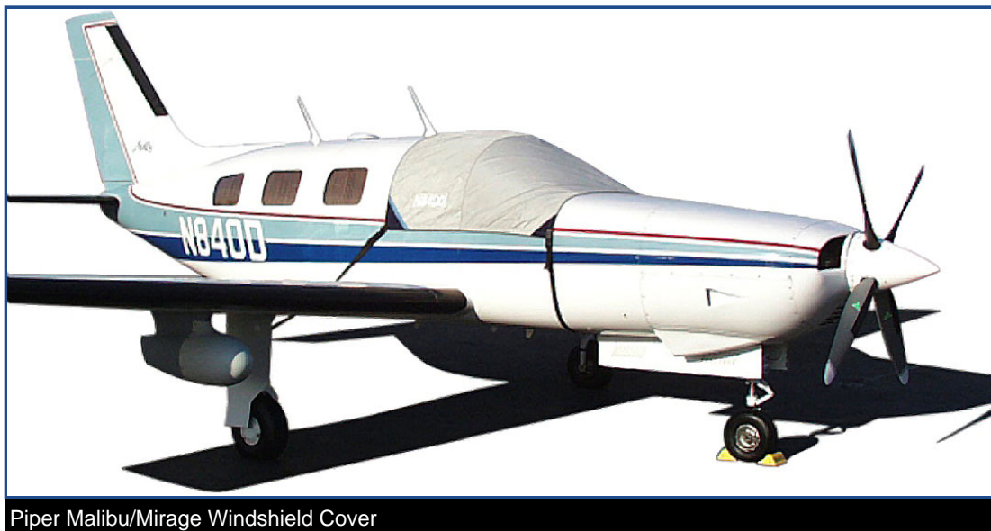
Piper Malibu/Mirage Windshield Cover