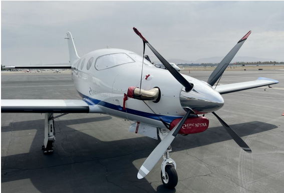
Epic Aircraft Prop Tie, Exhaust & Intake Covers Epic E1000 Prop Tie/Exhaust Covers, Intake Cover, Windshield HeatShields