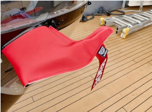
Airbus Helicopter H145 Pitot Tube Cover