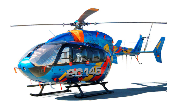
EC-145 Cabin Heatshield Set

Heatshields are interior sunshades for an aircraft's windows or canopy glass. The product is a unique composite of closed-cell foam with a silver mylar finish. The semi-rigid design is stiff enough to stand along the inside of the windshield using sun visors or window framing. It folds up flat and easily stores in the included storage sleeve. Some designs may require velcro and suction cups. A Heatshield is an excellent short-term remedy for cockpit overheating.