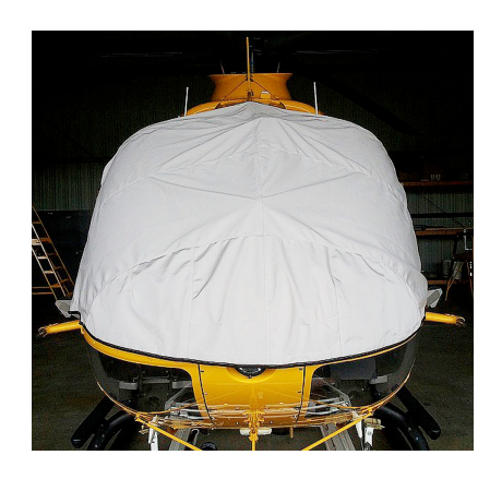
EC-135 Windshield/Skylights Cover, pinches in door jambs

This cover type is made from Silver Acrylic Sunbrella canvas and is 100% lined with a soft and smooth microfiber. Bruce's Custom Covers developed this material combination especially for aircraft protection. The outer material is medium weight and treated for water resistance, UV resistance and anti-static buildup. The inner lining is a very soft and smooth microfiber to prevent scratching. The material is very reflective, and tests show that the cabin interior temperature can be reduced to near-ambient temperature on the hottest of days. It is water, ice and snow repellent, yet breathable to allow moisture to escape from between the cover and the aircraft surface.