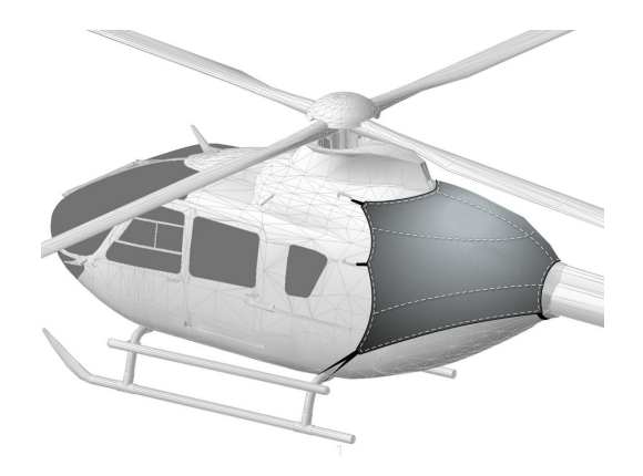
EC135 Exhaust Area Cover, illustration

The Eurocopter EC-135 Intake Cover. Details vary by model, but generally helicopter intake covers are designed to enclose the intake are only. They are smaller than helicopter engine covers, and their attachment details can vary from straps, to snaps, or some combination of the two. Specific information for each model is available on request.