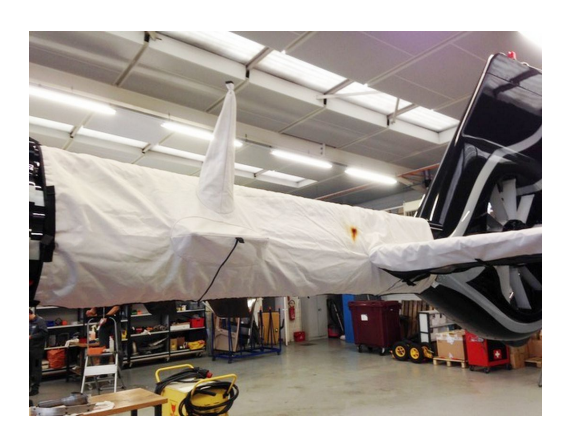
Airbus EC-135 Tailboom/Stabilizer Cover