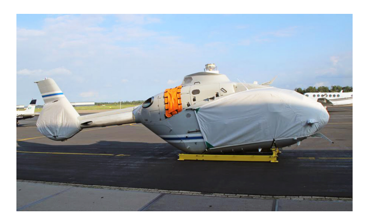
Bubble Cover and Tailfan Cover

The Tailboom Cover details vary by model, but generally the helicopter tail boom cover encloses the tail boom from the "bottleneck" to the aft end. They usually also cover the horizontal stabilizers, and are custom made to allow for antennae, lights, and other protrusions. They attach with straps underneath the tail boom. Covers for the vertical and horizontal stabilizers are also available separately. Specific information for each model is available on request.