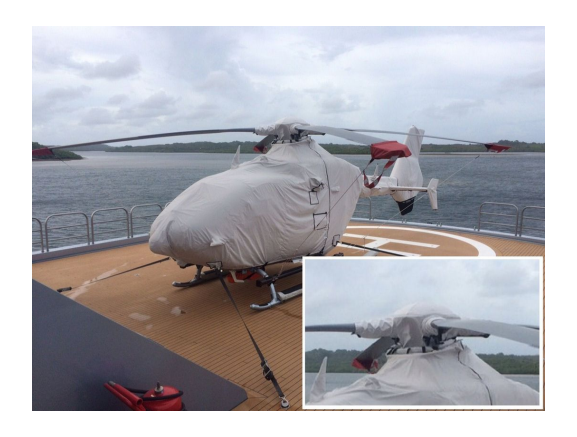
Airbus Helicopter AH135 Main Rotor Hub Cover