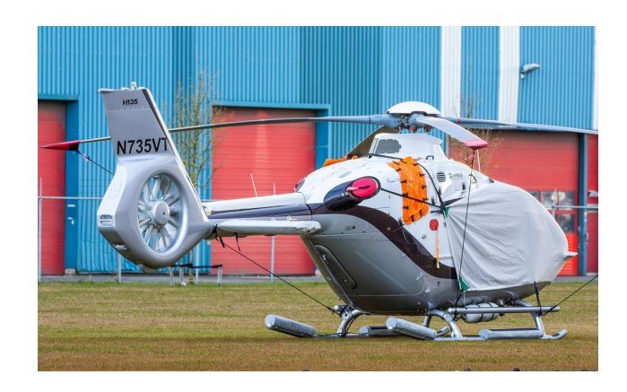
Airbus EC135T3 Blade Tie-Downs