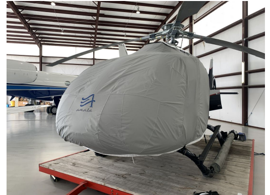
Airbus H-130 Bubble Cover, Travel Weight