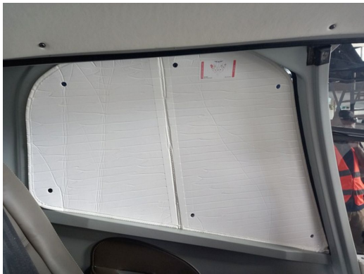
Airbus Helicopter EC130 B4 Side Window Heatshields

Heatshields are interior sunshades for an aircraft's windows or canopy glass. The product is a unique composite of closed-cell foam with a silver mylar finish. The semi-rigid design is stiff enough to stand along the inside of the windshield using sun visors or window framing. It folds up flat and easily stores in the included storage sleeve. Some designs may require velcro and suction cups. A Heatshield is an excellent short-term remedy for cockpit overheating.