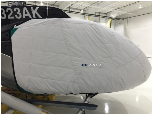
EC-130 Insulated Bubble Cover

This cover type is made from Silver Acrylic Sunbrella canvas and is 100% lined with a soft and smooth microfiber. Bruce's Custom Covers developed this material combination especially for aircraft protection. The outer material is medium weight and treated for water resistance, UV resistance and anti-static buildup. The inner lining is a very soft and smooth microfiber to prevent scratching. The material is very reflective, and tests show that the cabin interior temperature can be reduced to near-ambient temperature on the hottest of days. It is water, ice and snow repellent, yet breathable to allow moisture to escape from between the cover and the aircraft surface.