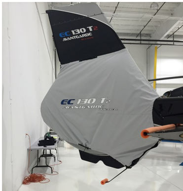
EC-130 Tailfan Cover

The Tailboom Cover details vary by model, but generally the helicopter tail boom cover encloses the tail boom from the "bottleneck" to the aft end. They usually also cover the horizontal stabilizers, and are custom made to allow for antennae, lights, and other protrusions. They attach with straps underneath the tail boom. Covers for the vertical and horizontal stabilizers are also available separately. Specific information for each model is available on request.