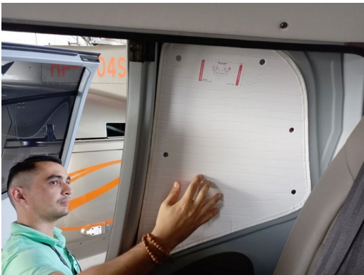
Airbus Helicopter EC130 B4 Side Window Heatshields