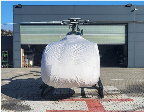
Airbus Helicopter H-130 Bubble Cover, Extends To Cover Fwd Engine Inlet

This cover type is made from Silver Acrylic Sunbrella canvas and is 100% lined with a soft and smooth microfiber. Bruce's Custom Covers developed this material combination especially for aircraft protection. The outer material is medium weight and treated for water resistance, UV resistance and anti-static buildup. The inner lining is a very soft and smooth microfiber to prevent scratching. The material is very reflective, and tests show that the cabin interior temperature can be reduced to near-ambient temperature on the hottest of days. It is water, ice and snow repellent, yet breathable to allow moisture to escape from between the cover and the aircraft surface.