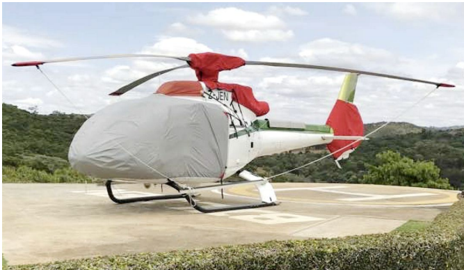
EC130 Bubble, Intake, Exhaust, Rotor Hub & Tailfan Covers

circulation and drainage in freezing weather. Some part numbers have features for an extra charge.