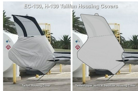
Airbus Helicopter H-130 Tailfan Housing Covers