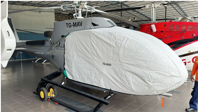
Airbus H-130 Insulated Bubble Cover