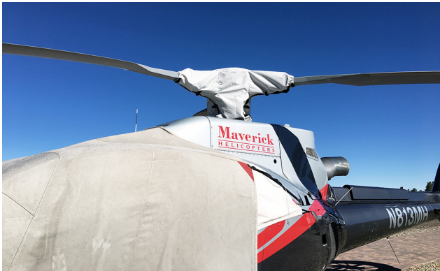
Eurocopter EC-130 Main Rotor Hub Cover