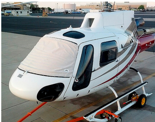
AS350 Windshield Cover, pinches in door jambs