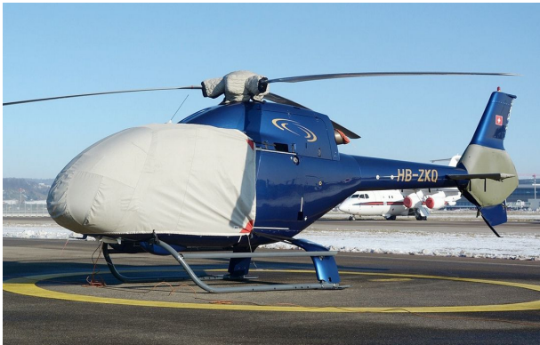
Eurocopter EC-120 Bubble, Rotor Mast & Tailfan Covers