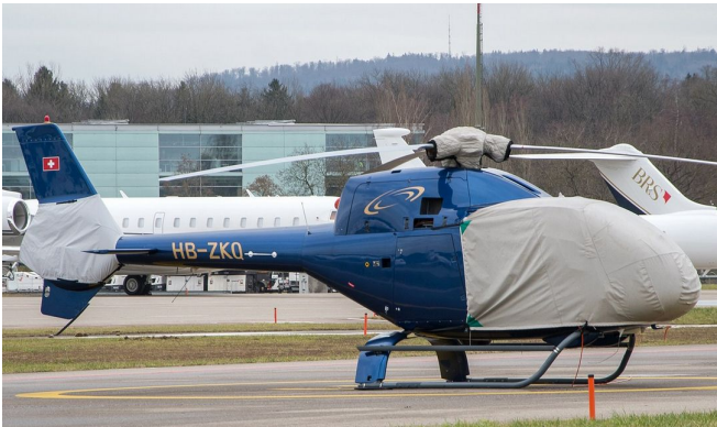
Eurocopter EC-120 Bubble, Rotor Mast & Tailfan Covers

Insulated Covers Material - A special composite material of solution-dyed polyester, 3M Thinsulate insulation, and soft nylon interior fabric. Our insulated covers are designed to complement an engine preheater and help retain heat in the engine compartment after shutdown. If you operate your aircraft in cold-weather, these covers will help prevent engine wear and tear.