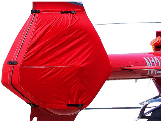
Eurocopter EC-120Tailfan Cover

The Tailboom Cover details vary by model, but generally the helicopter tail boom cover encloses the tail boom from the "bottleneck" to the aft end. They usually also cover the horizontal stabilizers, and are custom made to allow for antennae, lights, and other protrusions. They attach with straps underneath the tail boom. Covers for the vertical and horizontal stabilizers are also available separately. Specific information for each model is available on request.