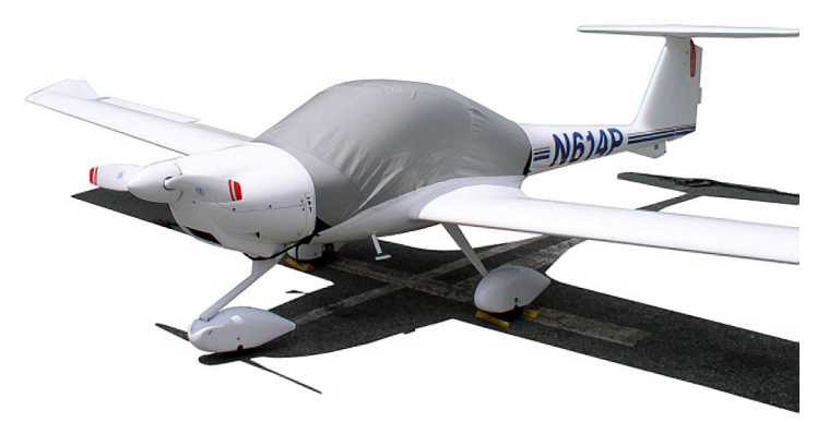
Diamond DA-20 Canopy Cover