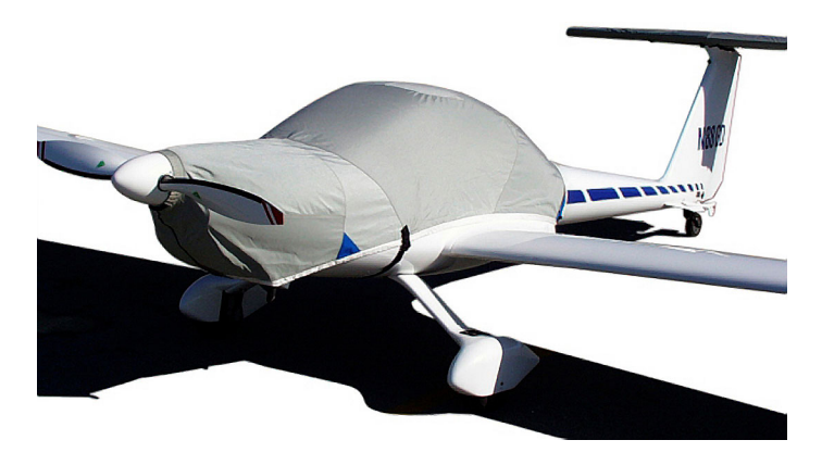
Diamond DA-20 Canopy/Engine Cover