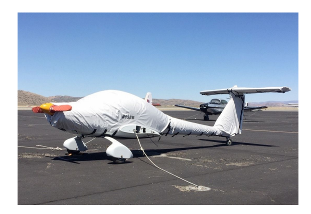
Dimona HK-36 Extended Canopy/Engine Cover, Empennage Cover Set

WINTER USE MATERIAL - Made with Solution-Dyed Polyester fabric, this option is intended for seasonal use to aid in deicing, rain mitigation, or for occasional travel. The material is lighter and more compact, but more susceptible to UV damage and may have a shorter useful life if used continuously outside than the all-year use material.