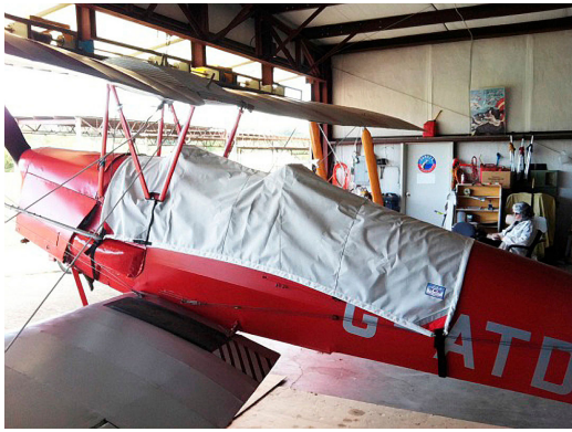
Canopy Cover for the De Havilland Tiger Moth