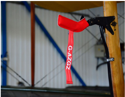
DeHavilland DH-82 Tiger Moth Pitot Cover

DeHavilland DH-82 Tiger Moth Pitot Tube Covers , NOT HEAT RESISTANT TYPE, are made of Naugahyde vinyl, and are designed to cover the entire pitot assembly. Slipping over the tube, the cover tightens around the base with a Velcro strap detail. A "Remove Before Flight" streamer is attached to the cover. Heat Resistant Pitot Covers are an upgrade to this design, and help prevent the pitot cover from melting onto the tube if the pitot heat is accidentally turned on while installed. If you want the set tethered together, please let us know.