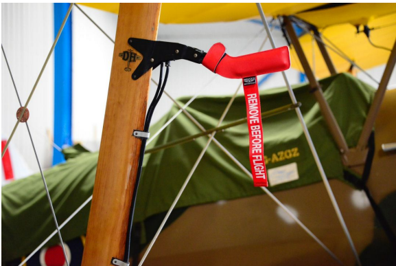
DeHavilland DH-82 Tiger Moth Pitot Cover