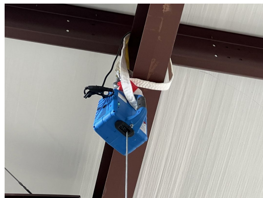
Stearman PT-13 Full Body Dust Cover, Remote Control Winch