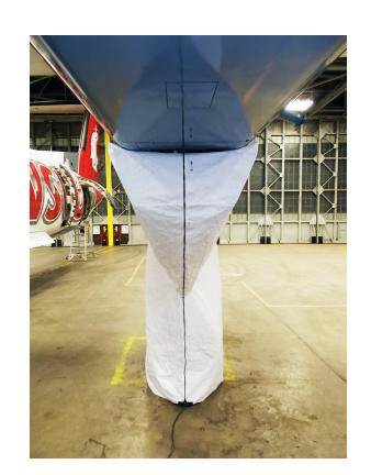
Q400, Main gear landing/tire covers - Cold Weather Ops