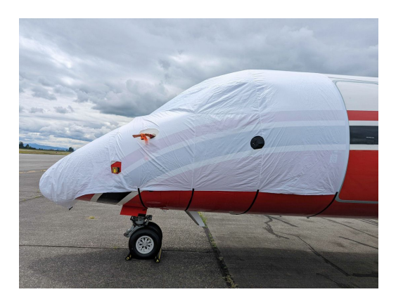
DeHavilland Dash 8, Q400 Cockpit/Nose Cover, test fit cover