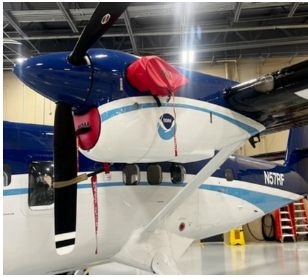
DeHavilland Twin Otter DHC6 Intake Plug, Exhaust Covers