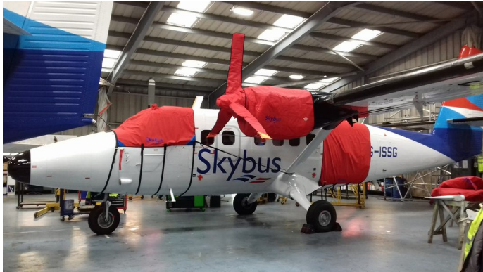
DeHavilland Twin Otter DHC6 (UV-18A) Cockpit Cover (CUSTOM COLOR)