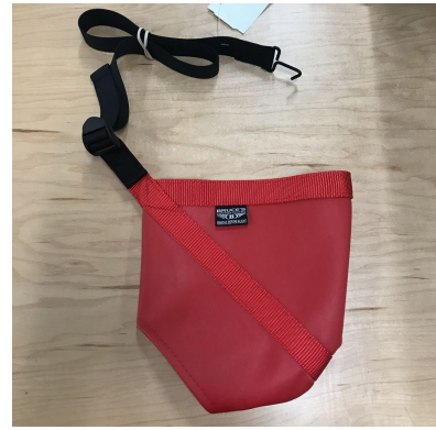
Prop Tie-Down, Various Models (secures with a hook to engine nacelle)