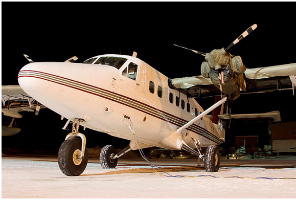
Twin Otter Wing, Horiz. Stab & Engine Covers