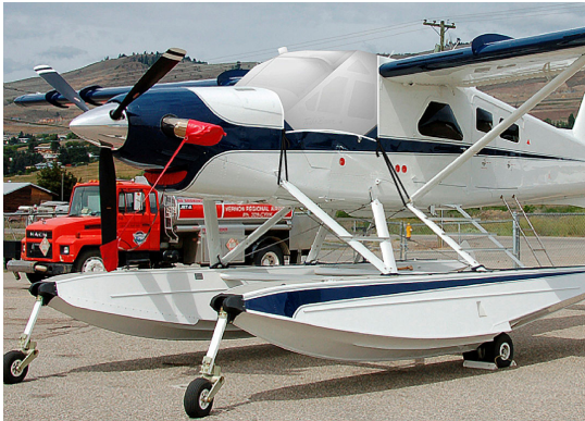
Turbo Beaver Cockpit Cover, Prop Tie/Exhaust Covers, Engine Plug

This cover type is made from Silver Acrylic Sunbrella canvas and is 100% lined with a soft and smooth microfiber. Bruce's Custom Covers developed this material combination especially for aircraft protection. The outer material is medium weight and treated for water resistance, UV resistance and anti-static buildup. The inner lining is a very soft and smooth microfiber to prevent scratching. The material is very reflective, and tests show that the cabin interior temperature can be reduced to near-ambient temperature on the hottest of days. It is water, ice and snow repellent, yet breathable to allow moisture to escape from between the cover and the aircraft surface.