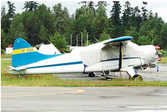
Beaver Canopy/Engine Cover

This cover type is made from Silver Acrylic Sunbrella canvas and is 100% lined with a soft and smooth microfiber. Bruce's Custom Covers developed this material combination especially for aircraft protection. The outer material is medium weight and treated for water resistance, UV resistance and anti-static buildup. The inner lining is a very soft and smooth microfiber to prevent scratching. The material is very reflective, and tests show that the cabin interior temperature can be reduced to near-ambient temperature on the hottest of days. It is water, ice and snow repellent, yet breathable to allow moisture to escape from between the cover and the aircraft surface.