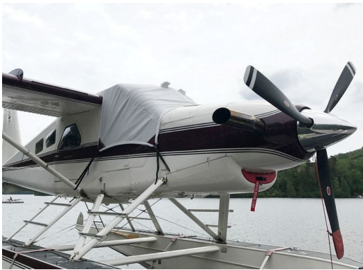
DeHavilland Turbo Beaver Cockpit Cover and Inlet Plug