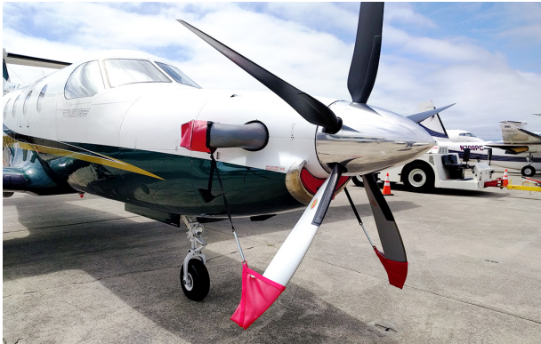
Main Intake Plug and Prop-Tie/Exhaust Covers. (Sold Separately)

Engine Inlet Plugs are custom fit for your Beech Denali 220 intakes, made with heavy-duty vinyl material, and stuffed with a single block of sculpted urethane foam. Each plug has a zipper that allows the foam to be removed and dried if necessary. Engine plugs have warning flags that are visible from the cockpit or 'remove before flight' streamers sewn onto the face of the plugs. Most plugs are imprinted with the aircraft registration number in black for an extra charge. Storage bag NOT included. Engine plugs may be inserted after flight when the engine is still warm. Engine Inlet Plugs are commonly referred to as Cowl Plugs, Intake Plugs, Cowl Blocks, Engine Blocks, and Engine Bungs.