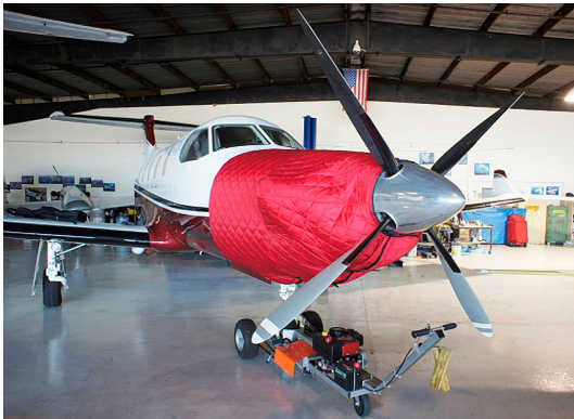
Pilatus PC-12 Insulated Engine Cover

This cover type is made from Silver Acrylic Sunbrella canvas and is 100% lined with a soft and smooth microfiber. Bruce's Custom Covers developed this material combination especially for aircraft protection. The outer material is medium weight and treated for water resistance, UV resistance and anti-static buildup. The inner lining is a very soft and smooth microfiber to prevent scratching. The material is very reflective, and tests show that the cabin interior temperature can be reduced to near-ambient temperature on the hottest of days. It is water, ice and snow repellent, yet breathable to allow moisture to escape from between the cover and the aircraft surface.