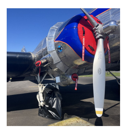
DC-3 Engine Plugs, Tire Covers