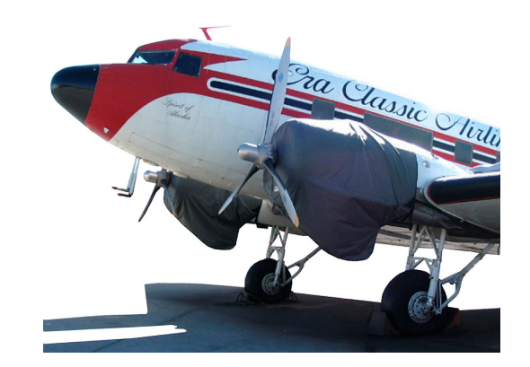
DC3 Engine Covers are custom made for various engine mod's.