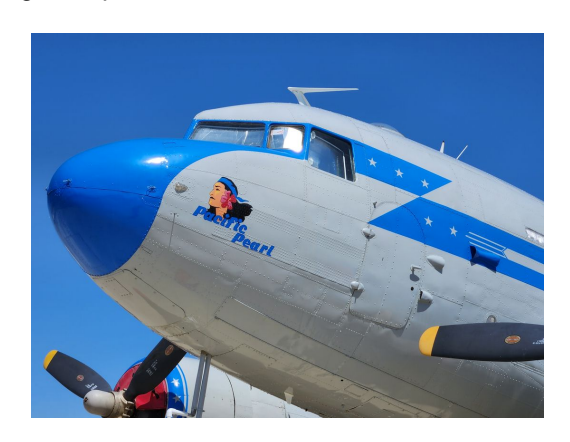
DC-3 Cockpit HeatShields