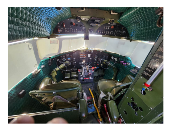
DC-3C Cockpit Heatshields

Cockpit Heatshields are interior sunshades for the aircraft's cockpit. The product is a unique composite of closed-cell foam with a silver mylar finish. The semi-rigid design is stiff enough to stand inside the window framing. The set folds up flat and is easily stored in the included storage sleeve. Some designs may require velcro and suction cups. A Heatshield is an excellent short-term remedy for cockpit overheating, but an external fabric cover is more effective for long-term protection.