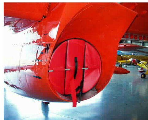
Exhaust Plug, folding type