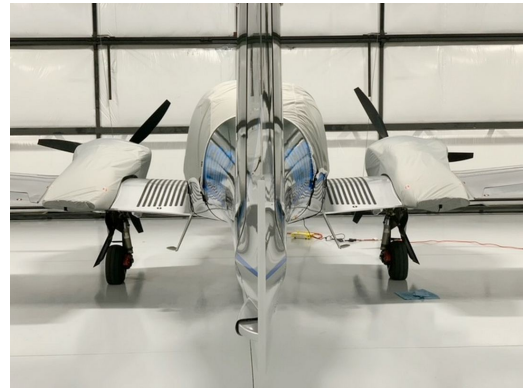
Diamond DA-62 Travel Weight Canopy & Engine Covers