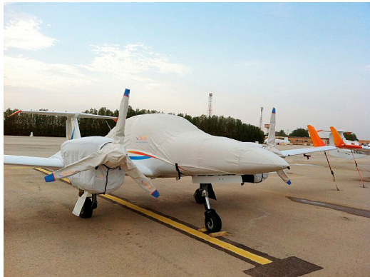
Diamond DA-42NG Canopy/Nose, Engine & Prop Covers