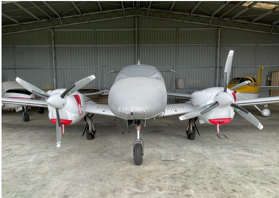
DA-62 Travel Weight Canopy/Nose Cover, Engine Plugs

Engine Inlet Plugs are custom fit for your Diamond DA-62 intakes, made with heavy-duty vinyl material, and stuffed with a single block of sculpted urethane foam. Each plug has a zipper that allows the foam to be removed and dried if necessary. Engine plugs have warning flags that are visible from the cockpit or 'remove before flight' streamers sewn onto the face of the plugs. Most plugs are imprinted with the aircraft registration number in black for an extra charge. Storage bag NOT included. Engine plugs may be inserted after flight when the engine is still warm. Engine Inlet Plugs are commonly referred to as Cowl Plugs, Intake Plugs, Cowl Blocks, Engine Blocks, and Engine Bungs.