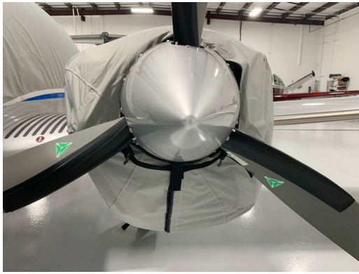
Diamond DA-62 Travel Weight Canopy & Engine Covers