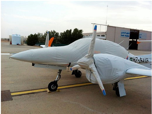
Diamond DA-42NG Canopy/Nose, Engine & Prop Covers