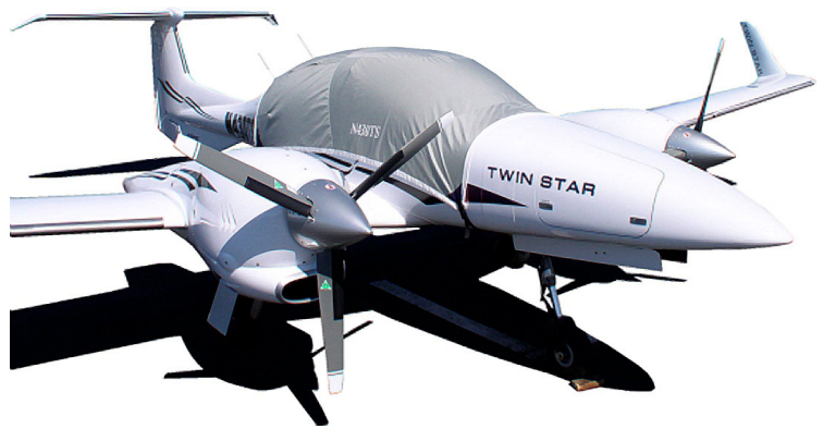
Twinstar Standard Canopy Cover