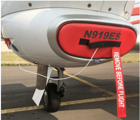
Diamond Da-42 Engine Inlet Plugs Set of 4