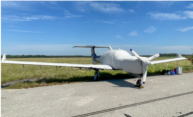
Diamond DA-50 Extended Canopy/Engine Cover, Wing & Prop Covers

This cover type is made from Silver Acrylic Sunbrella canvas and is 100% lined with a soft and smooth microfiber. Bruce's Custom Covers developed this material combination especially for aircraft protection. The outer material is medium weight and treated for water resistance, UV resistance and anti-static buildup. The inner lining is a very soft and smooth microfiber to prevent scratching. The material is very reflective, and tests show that the cabin interior temperature can be reduced to near-ambient temperature on the hottest of days. It is water, ice and snow repellent, yet breathable to allow moisture to escape from between the cover and the aircraft surface.