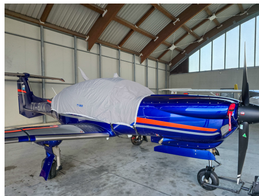
Diamond DA-50 Canopy Cover, Engine Plugs