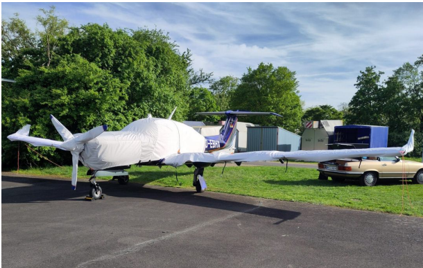
Diamond DA-50 Extended Canopy/Engine, Prop & Wing Covers (test fit)