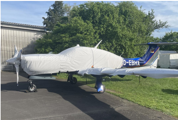
Diamond DA-50 Extended Canopy/Engine, Prop & Wing Covers (test fit)

WINTER USE MATERIAL - Made with Solution-Dyed Polyester fabric, this option is intended for seasonal use to aid in deicing, rain mitigation, or for occasional travel. The material is lighter and more compact, but more susceptible to UV damage and may have a shorter useful life if used continuously outside than the all-year use material.