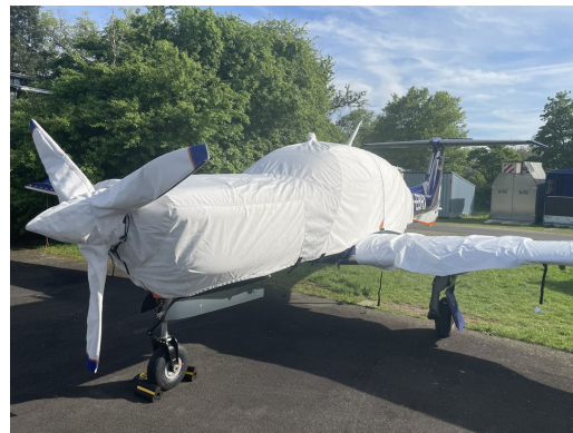
Diamond DA-50 Extended Canopy/Engine, Prop & Wing Covers (test fit)