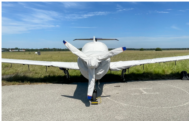
Diamond DA-50 Extended Canopy/Engine Cover, Wing & Prop Covers

This cover type is made from Silver Acrylic Sunbrella canvas and is 100% lined with a soft and smooth microfiber. Bruce's Custom Covers developed this material combination especially for aircraft protection. The outer material is medium weight and treated for water resistance, UV resistance and anti-static buildup. The inner lining is a very soft and smooth microfiber to prevent scratching. The material is very reflective, and tests show that the cabin interior temperature can be reduced to near-ambient temperature on the hottest of days. It is water, ice and snow repellent, yet breathable to allow moisture to escape from between the cover and the aircraft surface.