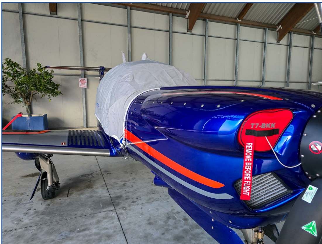
Diamond DA-50 Canopy Cover, Engine Plugs