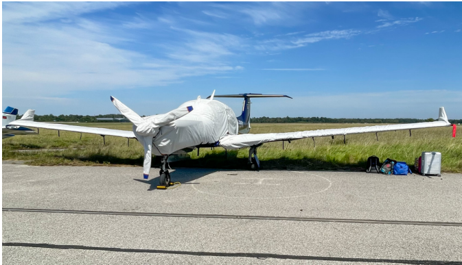
Diamond DA-50 Extended Canopy/Engine Cover, Wing & Prop Covers