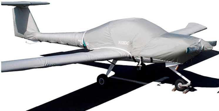
DA-20 Full Cover Set