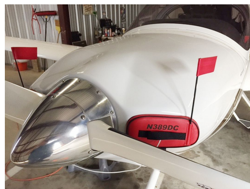
Diamond DA-20-C1 Engine Inlet Plugs