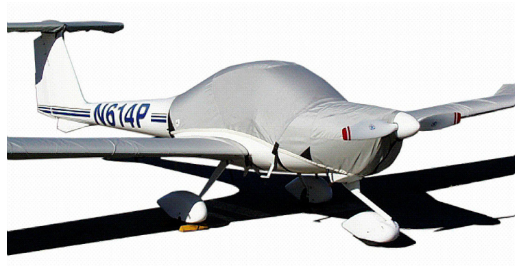
Diamond DA-20 Canopy/Engine, Wing & Horiz. Stab. Covers