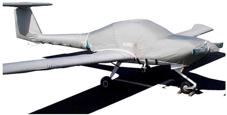
DA-20 Full Cover Set