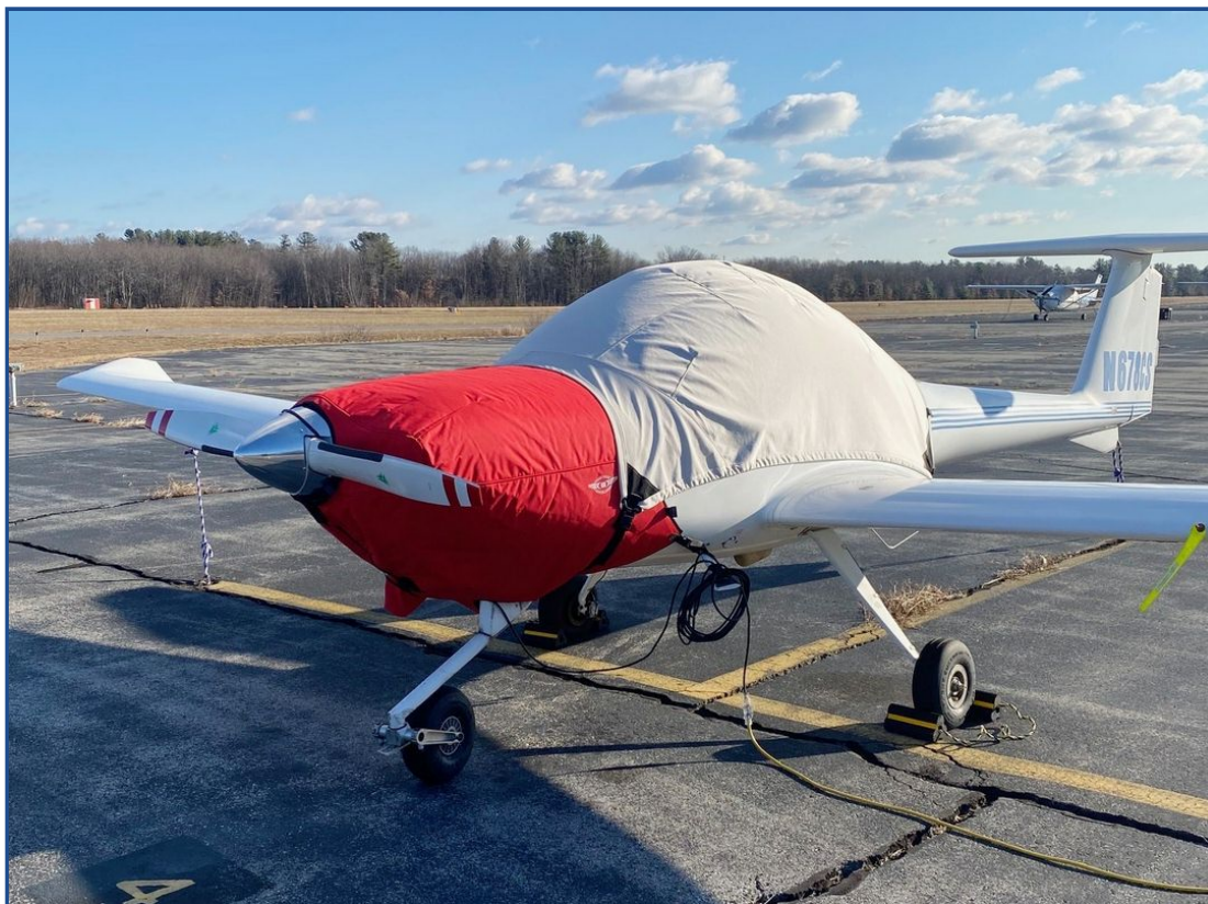
Diamond DA20-C1 Insulated Engine Cover, C1 models