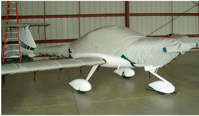
DA-20 Canopy/Engine, Prop/Spinner, Wing, Tailboom, Horiz. Stab. Covers