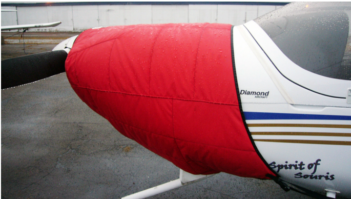
Diamond DA-20-C1 Insulated Engine Cover