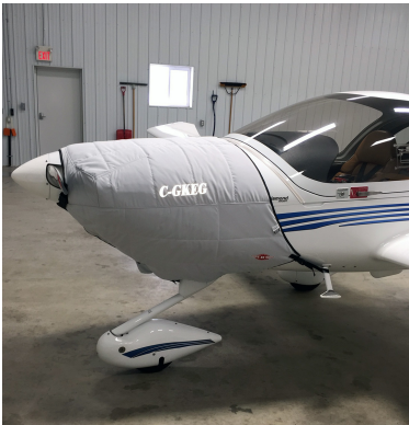
Diamond DA-20-C1 Insulated Engine Cover

This cover type is made from Silver Acrylic Sunbrella canvas and is 100% lined with a soft and smooth microfiber. Bruce's Custom Covers developed this material combination especially for aircraft protection. The outer material is medium weight and treated for water resistance, UV resistance and anti-static buildup. The inner lining is a very soft and smooth microfiber to prevent scratching. The material is very reflective, and tests show that the cabin interior temperature can be reduced to near-ambient temperature on the hottest of days. It is water, ice and snow repellent, yet breathable to allow moisture to escape from between the cover and the aircraft surface.