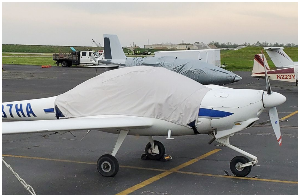
Diamond DA-20 Katana

This cover type is made from Silver Acrylic Sunbrella canvas and is 100% lined with a soft and smooth microfiber. Bruce's Custom Covers developed this material combination especially for aircraft protection. The outer material is medium weight and treated for water resistance, UV resistance and anti-static buildup. The inner lining is a very soft and smooth microfiber to prevent scratching. The material is very reflective, and tests show that the cabin interior temperature can be reduced to near-ambient temperature on the hottest of days. It is water, ice and snow repellent, yet breathable to allow moisture to escape from between the cover and the aircraft surface.