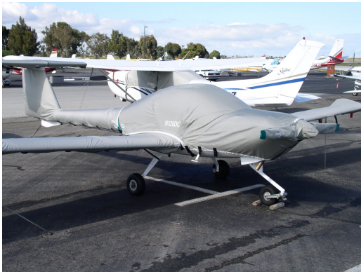
DA-20 Full Cover Set