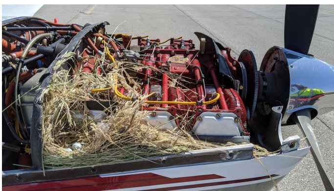
ENGINE PLUGS PREVENT BIRD NEST FOD. Piper Saratoga Engine Cowling Bird's Nest

Engine Inlet Plugs are custom fit for your Diamond DA-20, Katana, Eclipse intakes, made with heavy-duty vinyl material, and stuffed with a single block of sculpted urethane foam. Each plug has a zipper that allows the foam to be removed and dried if necessary. Engine plugs have warning flags that are visible from the cockpit or 'remove before flight' streamers sewn onto the face of the plugs. Most plugs are imprinted with the aircraft registration number in black for an extra charge. Storage bag NOT included. Engine plugs may be inserted after flight when the engine is still warm. Engine Inlet Plugs are commonly referred to as Cowl Plugs, Intake Plugs, Cowl Blocks, Engine Blocks, and Engine Bunges.