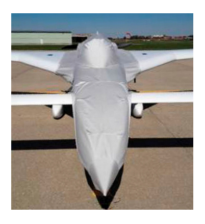
Long EZ Canopy/Nose/Engine Cover w/ Wing Extentions