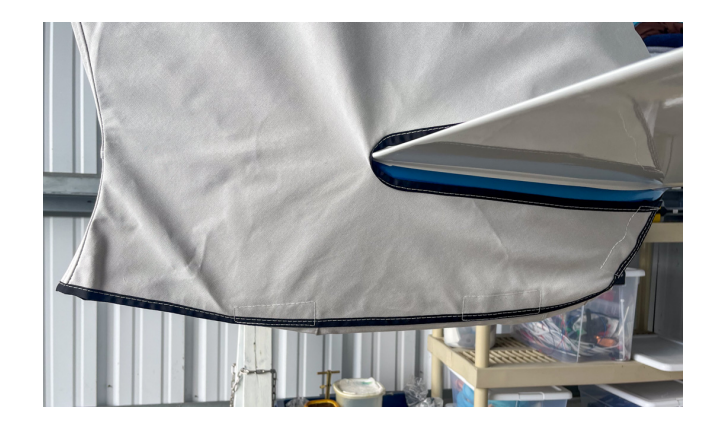
Cozy All Models Vertical Stabilizer Covers, All Year Use