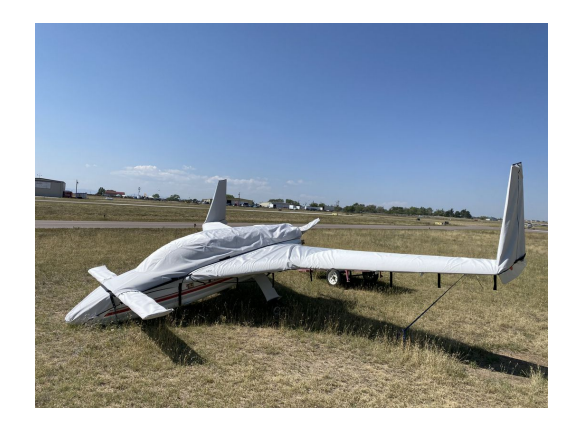
Cozy Mk IV Complete Cover Set

WINTER USE MATERIAL - Made with Solution-Dyed Polyester fabric, this option is intended for seasonal use to aid in deicing, rain mitigation, or for occasional travel. The material is lighter and more compact, but more susceptible to UV damage and may have a shorter useful life if used continuously outside than the all-year use material.