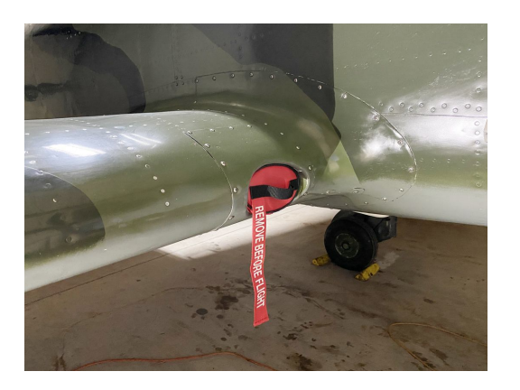
Nanchang CJ-6A Leading Edge Plug