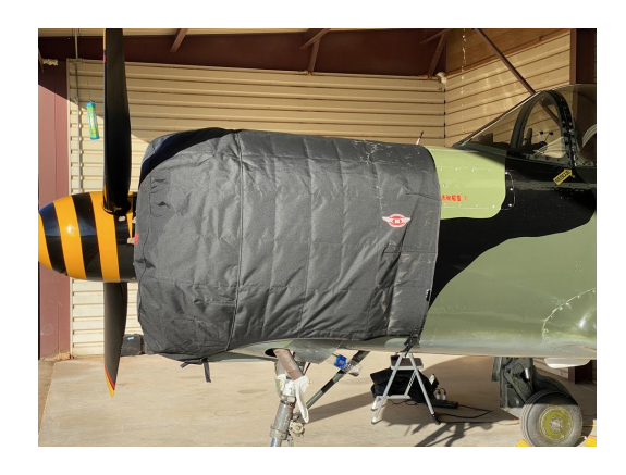
Nanchang CJ6 Insulated Engine Cover

The material is very reflective, and tests show that the cabin interior temperature can be reduced to near-ambient temperature on the hottest of days. It is water, ice and snow repellent, yet breathable to allow moisture to escape from between the cover and the aircraft surface.