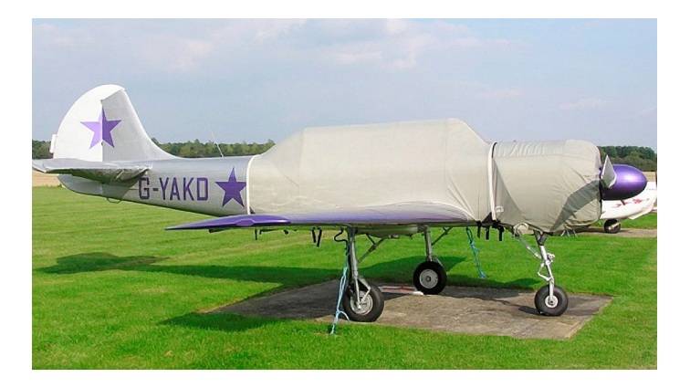
Yak 52 Extended Canopy, Engine & Horiz. Stab. Covers