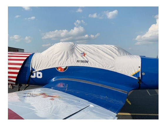
Nanchang CJ-6 Canopy Cover for Malcolm Hood