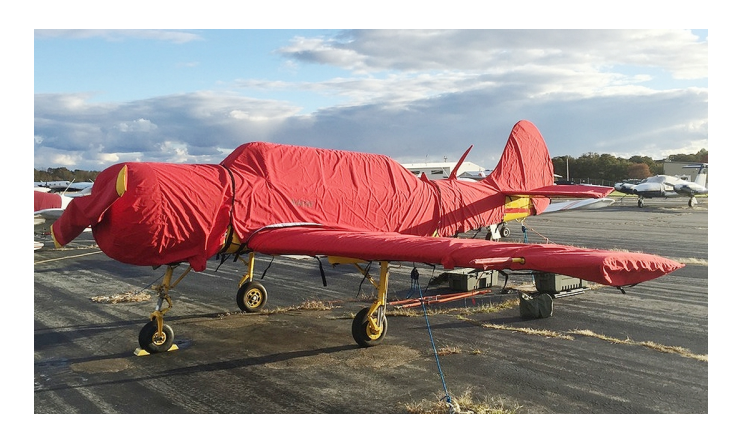
Yak 52 Full Cover Set