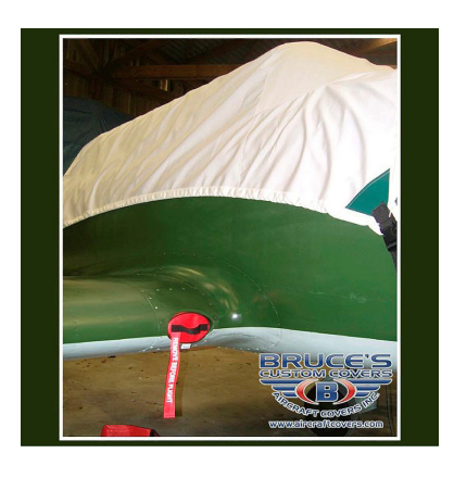
CJ6 Canopy Cover & Leading Edge Inlet Plug