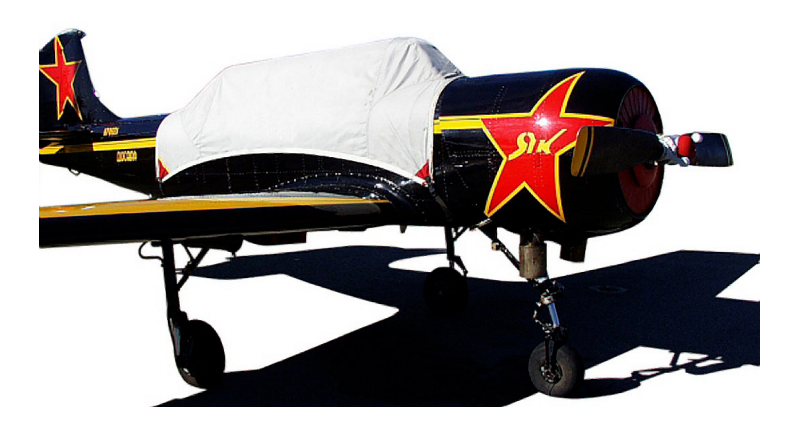
Yak 52 Canopy Cover