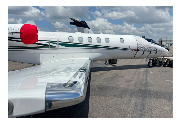
Cessna Citationjet 525C, CJ-4 Cockpit Cover

This cover type is made from Silver Acrylic Sunbrella canvas and is 100% lined with a soft and smooth microfiber. Bruce's Custom Covers developed this material combination especially for aircraft protection. The outer material is medium weight and treated for water resistance, UV resistance and anti-static buildup. The inner lining is a very soft and smooth microfiber to prevent scratching. The material is very reflective, and tests show that the cabin interior temperature can be reduced to near-ambient temperature on the hottest of days. It is water, ice and snow repellent, yet breathable to allow moisture to escape from between the cover and the aircraft surface.