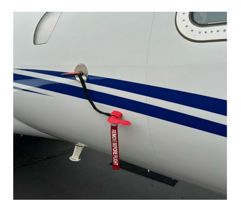
Cessna Citationjet 525C, CJ-4 Static Wick Protectors, 3 Per Wing, 1 On Tailcone Area