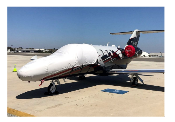
Citationjet CJ1 Cockpit/Nose Cover