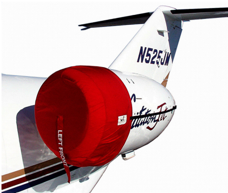
Engine Inlet Cover

The Cessna Citationjet 525B, CJ-3 Intake/Exhaust Plugs are custom fit for the intake and exhaust openings, made with heavy-duty vinyl material, and stuffed with a single block of sculpted urethane foam. Each plug has a zipper that allows the foam to be removed and dried if necessary. Engine plugs have 'remove before flight' streamers sewn onto the face of the plugs. Most plugs are imprinted with the aircraft registration number in black. Engine plugs may be inserted after flight when the engine is still warm. Engine Inlet Plugs are commonly referred to as Cowl Plugs, Intake Plugs, Cowl Blocks, Engine Blocks, and Engine Bungs.