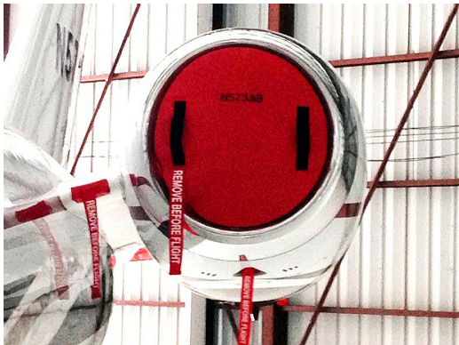
Citation CJ4 Intake Plugs pair