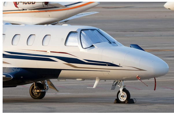
Cessna Citationjet 525, CJ-I, CJ1+, & M2 Cockpit Heatshields