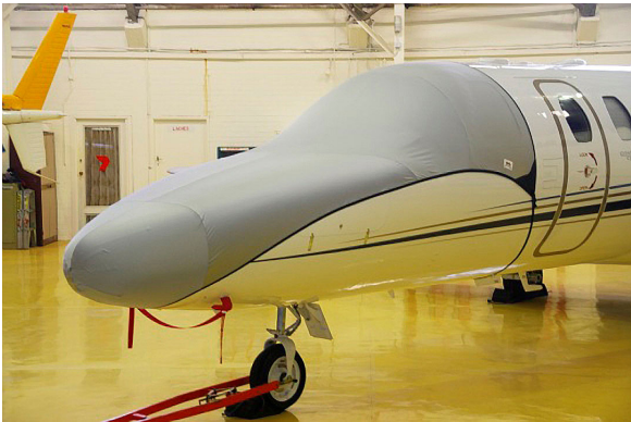
Citationjet CJ3 Cockpit/Nose Travel Cover

This cover type is made from Silver Acrylic Sunbrella canvas and is 100% lined with a soft and smooth microfiber. Bruce's Custom Covers developed this material combination especially for aircraft protection. The outer material is medium weight and treated for water resistance, UV resistance and anti-static buildup. The inner lining is a very soft and smooth microfiber to prevent scratching. The material is very reflective, and tests show that the cabin interior temperature can be reduced to near-ambient temperature on the hottest of days. It is water, ice and snow repellent, yet breathable to allow moisture to escape from between the cover and the aircraft surface.