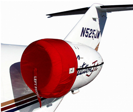
Engine Inlet Cover

The Cessna Citationjet 525A, CJ-2, & CJ2+ Intake/Exhaust Plugs are custom fit for the intake and exhaust openings, made with heavy-duty vinyl material, and stuffed with a single block of sculpted urethane foam. Each plug has a zipper that allows the foam to be removed and dried if necessary. Engine plugs have 'remove before flight' streamers sewn onto the face of the plugs. Most plugs are imprinted with the aircraft registration number in black. Engine plugs may be inserted after flight when the engine is still warm. Engine Inlet Plugs are commonly referred to as Cowl Plugs, Intake Plugs, Cowl Blocks, Engine Blocks, and Engine Bungs.