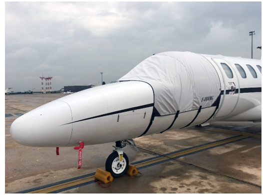
Cessna Citationjet 525A, CJ-2, & CJ2+ Cockpit Cover