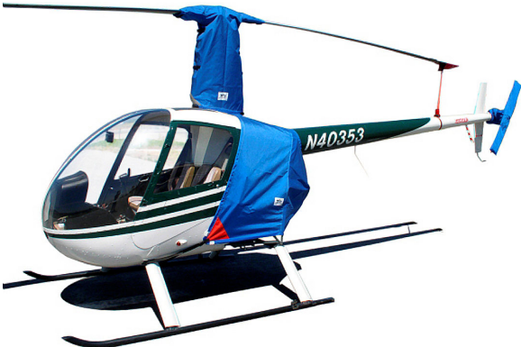
Guimbal Cabri G2 Tailfan Housing Fenestron Cover Robinson R-22 Engine, Rotor Mast & Tail Rotor Covers, with Blade Tie-down