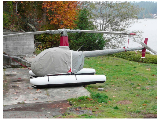
Robinson R-22 Bubble Cover (Ext. Past Rotor Hub), Engine Cover, Tailboom Cover, Blade Covers, Rotor Hub Cover, & Tail Rotor Gear Box Cover