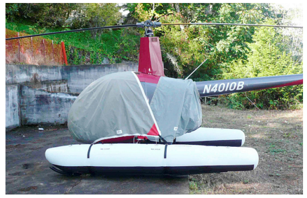
Robinson R-22 Standard Bubble Cover & Engine Cover