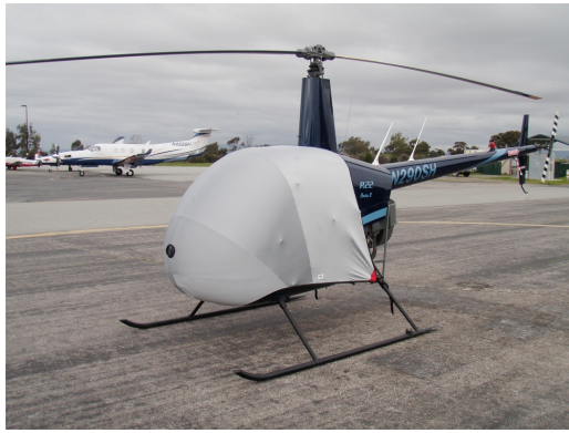
Robinson R-22 Light Weight Travel Cover