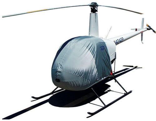
Robinson R-22 Standard Bubble Cover