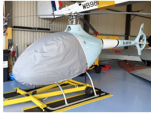
Cabri G2 Light Weight Travel Bubble Cover