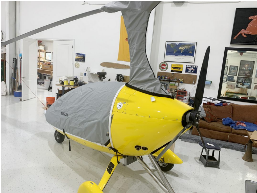
Autogyro Calidus Gyrocopter Canopy/Nose & Rotor Hub/Mast Cover