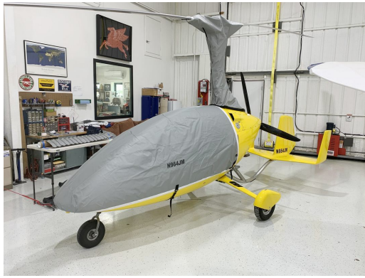
Autogyro Calidus Gyrocopter Canopy/Nose & Rotor Hub/Mast Cover