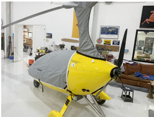
Autogyro Calidus Gyrocopter Canopy/Nose & Rotor Hub/Mast Cover

Rotor Hub Covers overlaps with the Blade Covers to ensure complete protection for the entire main rotor system. Designed like a jacket with sleeves and no collar, the rotor hub cover fastens together below each blade with Delrin buckles. The Rotor Hub Cover is normally made from Solution-Dyed Polyester.