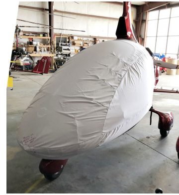
Cavalon Gyrocopter Bubble Cover, test fit cover