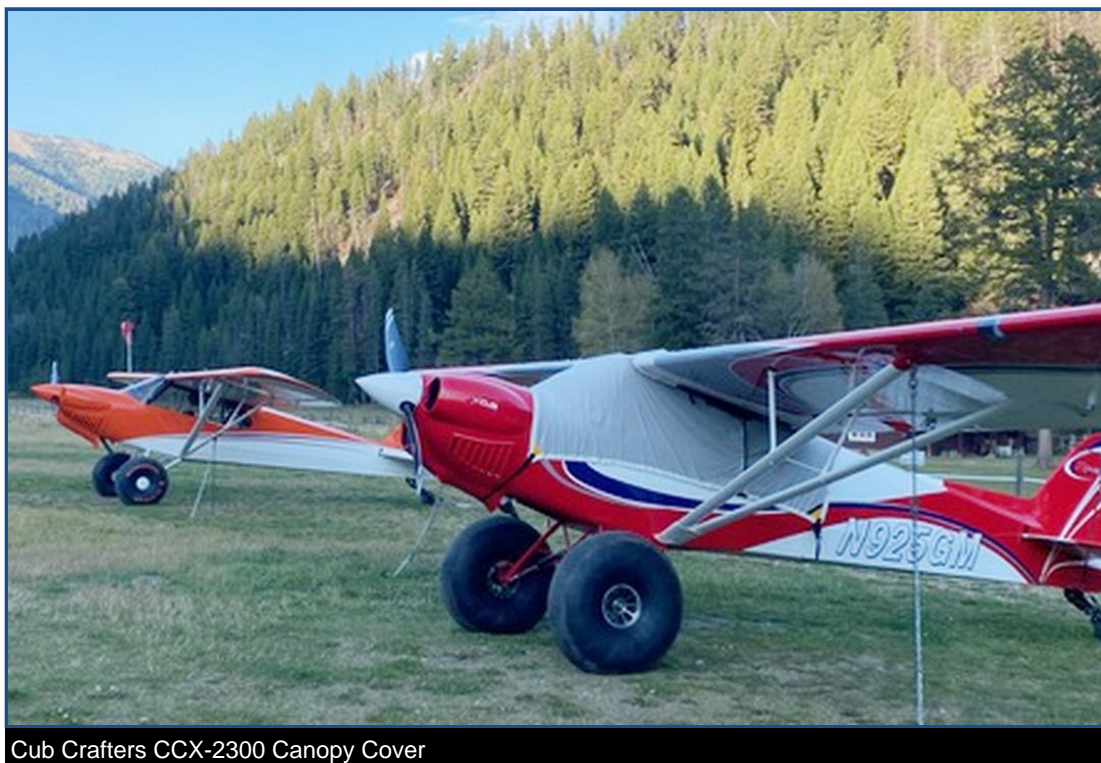
Cub Crafters CCX-2300 Canopy Cover