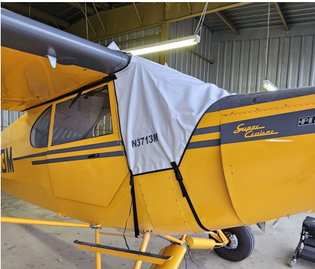
Piper PA-12: Super Cruiser, J5 Cub Windshield/Skylight Cover

This cover type is made from Silver Acrylic Sunbrella canvas and is 100% lined with a soft and smooth microfiber. Bruce's Custom Covers developed this material combination especially for aircraft protection. The outer material is medium weight and treated for water resistance, UV resistance and anti-static buildup. The inner lining is a very soft and smooth microfiber to prevent scratching. The material is very reflective, and tests show that the cabin interior temperature can be reduced to near-ambient temperature on the hottest of days. It is water, ice and snow repellent, yet breathable to allow moisture to escape from between the cover and the aircraft surface.