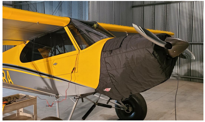
Cub Crafters CC11-160 Insulated Engine Cover