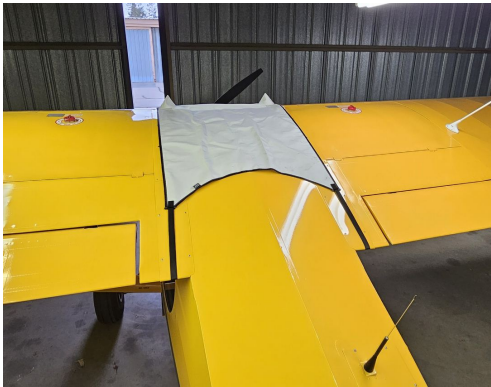
Piper PA-12: Super Cruiser, J5 Cub Windshield/Skylight Cover