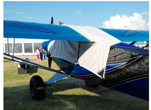
Cub Crafters Carbon Cub Canopy Cover