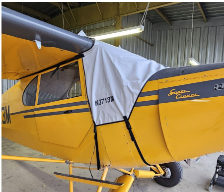
Piper PA-12: Super Cruiser, J5 Cub Windshield/Skylight Cover

This cover type is made from Silver Acrylic Sunbrella canvas and is 100% lined with a soft and smooth microfiber. Bruce's Custom Covers developed this material combination especially for aircraft protection. The outer material is medium weight and treated for water resistance, UV resistance and anti-static buildup. The inner lining is a very soft and smooth microfiber to prevent scratching. The material is very reflective, white, and tests show that the cabin interior temperature can be reduced to near-ambient temperature on the hottest of days. It is water, ice and snow repellent, yet breathable to allow moisture to escape from between the cover and the aircraft surface.