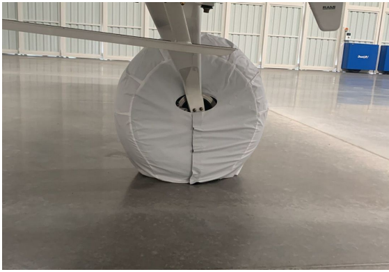
Cub Crafters Tire Covers, tricycle gear, test fit covers