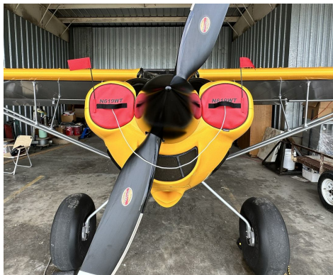
Cub Crafters CC-19 X-Cub Engine Plugs

Engine Inlet Plugs are custom fit for your CubCrafters CC-18, 19, 20, Top Cub, CCK-1865, CC-19 X-Cub, CCX-2000, EX-3, FX-3 intakes, made with heavy-duty vinyl material, and stuffed with a single block of sculpted urethane foam. Each plug has a zipper that allows the foam to be removed and dried if necessary. Engine plugs have warning flags that are visible from the cockpit or 'remove before flight' streamers sewn onto the face of the plugs. Most plugs are imprinted with the aircraft registration number in black for an extra charge. Storage bag NOT included. Engine plugs may be inserted after flight when the engine is still warm. Engine Inlet Plugs are commonly referred to as Cowl Plugs, Intake Plugs, Cowl Blocks, Engine Blocks, and Engine Bungs.