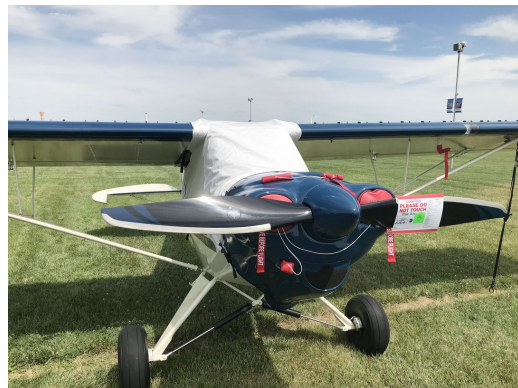
Cub Crafters EX2 Canopy Cover, Engine Plugs