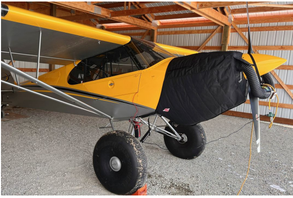
CubCrafters CCX-2000 Insulated Engine Cover