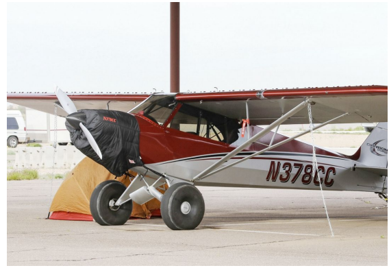
Cub Crafters CC11-160 Insulated Engine Cover