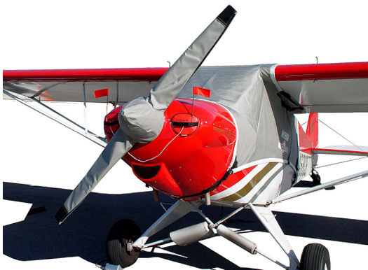
Cub Crafters Sport Cub Prop Cover & Engine Plugs

Engine Inlet Plugs are custom fit for your CubCrafters CC-11, Sport Cub S2, & Carbon Cub intakes, made with heavy-duty vinyl material, and stuffed with a single block of sculpted urethane foam. Each plug has a zipper that allows the foam to be removed and dried if necessary. Engine plugs have warning flags that are visible from the cockpit or 'remove before flight' streamers sewn onto the face of the plugs. Most plugs are imprinted with the aircraft registration number in black for an extra charge. Storage bag NOT included. Engine plugs may be inserted after flight when the engine is still warm. Engine Inlet Plugs are commonly referred to as Cowl Plugs, Intake Plugs, Cowl Blocks, Engine Blocks, and Engine Bungs.