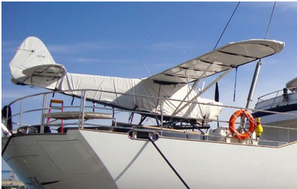
Cub Crafters CC-11 Complete Cover Set