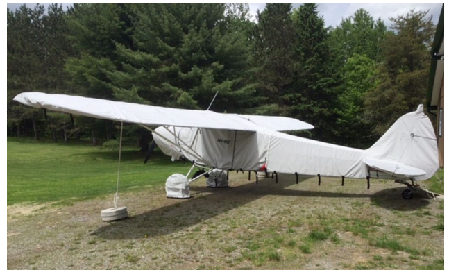
Bellanca Citabria Over-the-Top Canopy Cover, extended to cover gas caps