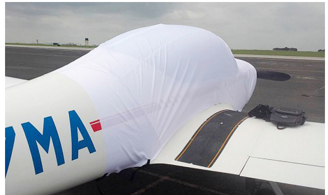
Taifun 17E Canopy/Engine Cover, test fit cover