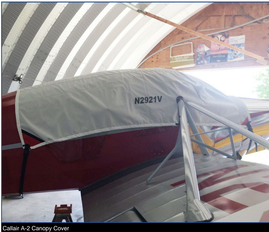
Callair A-2 Canopy Cover