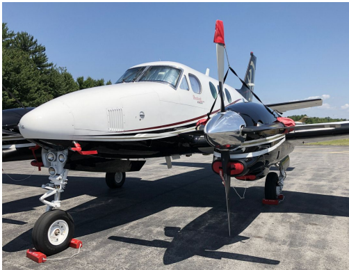
Beech C90A Prop Tie Downs/Exhaust Covers

Engine Inlet Plugs are custom fit for your Beech King Air C90B, C90GT intakes, made with heavy-duty vinyl material, and stuffed with a single block of sculpted urethane foam. Each plug has a zipper that allows the foam to be removed and dried if necessary. Engine plugs have warning flags that are visible from the cockpit or 'remove before flight' streamers sewn onto the face of the plugs. Most plugs are imprinted with the aircraft registration number in black for an extra charge. Storage bag NOT included. Engine plugs may be inserted after flight when the engine is still warm. Engine Inlet Plugs are commonly referred to as Cowl Plugs, Intake Plugs, Cowl Blocks, Engine Blocks, and Engine Bungs.