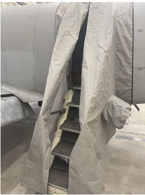
King Air Airstair Coor Cover

WINTER USE MATERIAL - Made with Solution-Dyed Polyester fabric, this option is intended for seasonal use to aid in deicing, rain mitigation, or for occasional travel. The material is lighter and more compact, but more susceptible to UV damage and may have a shorter useful life if used continuously outside than the all-year use material.