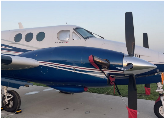
Beech King Air C90 Cockpit HeatShields

Cockpit Heatshields are interior sunshades for the aircraft's cockpit. The product is a unique composite of closed-cell foam with a silver mylar finish. The semi-rigid design is stiff enough to stand inside the window framing. The set folds up flat and is easily stored in the included storage sleeve. Some designs may require velcro and suction cups. A Heatshield is an excellent short-term remedy for cockpit overheating, but an external fabric cover is more effective for long-term protection.