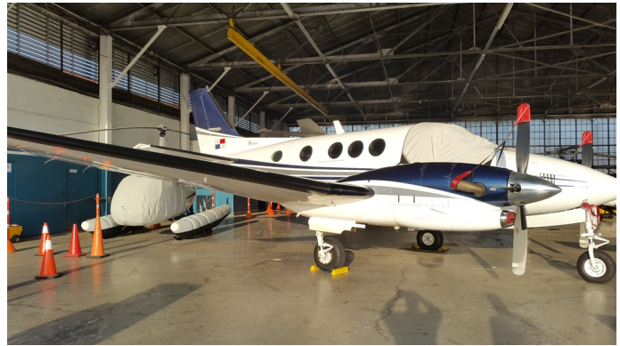
Raytheon Beech King Air Cockpit Cover, Prop Tie/Exhaust Covers, Inlet Plugs