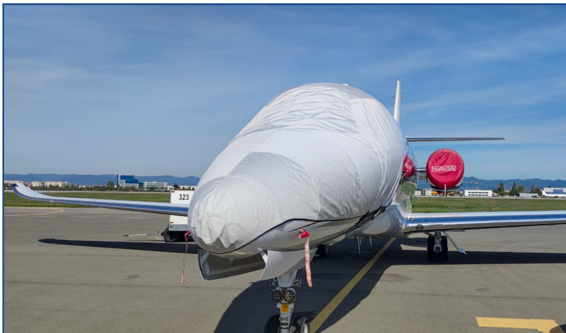
Cessna Citation Latitude (680A) Cockpit/Nose Cover, Doesn't Cover Pitot Tubes