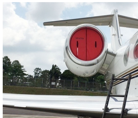
Grumman Gulfstream G450 Intake Plugs