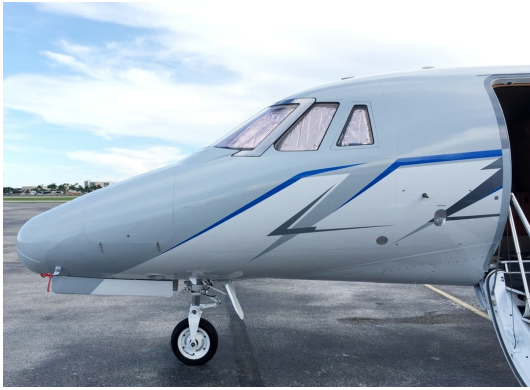
Cessna Citation 650 Cockpit HeataShields

Cockpit Heatshields are interior sunshades for the aircraft's cockpit. The product is a unique composite of closed-cell foam with a silver mylar finish. The semi-rigid design is stiff enough to stand inside the window framing. The set folds up flat and is easily stored in the included storage sleeve. Some designs may require velcro and suction cups. Our Heatshields for jets are offered white side out because some aircraft manufacturers have issued advisories against reflective window inserts due to potential heat damage. A Heatshield is an excellent short-term remedy for cockpit overheating, but an external fabric cover is more effective for long-term protection.