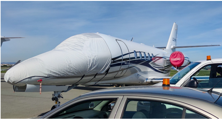
Cessna Citation Latitude (680A) Cockpit/Nose Cover, Doesn't Cover Pitot Tubes