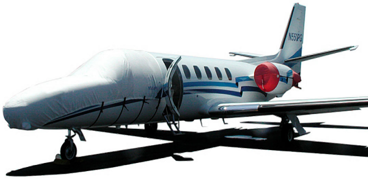
Cessna Citation Nose/Cockpit Cover, Engine Covers