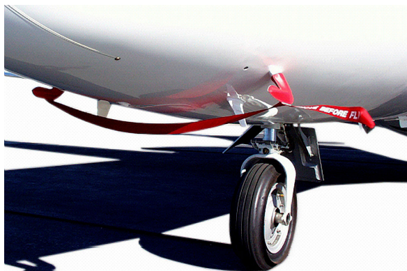
Cessna Citation I Pitot Covers

The Engine Inlet Plugs are custom fit for your Cessna Citation Latitude (680A) intakes, made with heavy-duty vinyl material, and stuffed with a single block of sculpted urethane foam. Each plug has a zipper that allows the foam to be removed and dried if necessary. Engine plugs have 'remove before flight' streamers sewn onto the face of the plugs. Most plugs are imprinted with the aircraft registration number in black for an extra charge. Storage bag NOT included. Engine plugs may be inserted after flight when the engine is still warm. Engine Inlet Plugs are commonly referred to as Cowl Plugs, Intake Plugs, Cowl Blocks, Engine Blocks, and Engine Bungs.