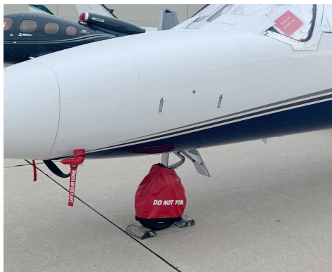
Cessna Citation Nose Tire Cover

ALL-YEAR USE MATERIAL - Made with Silver Acrylic Sunbrella canvas, the all-year use material is the best option for sun protection and cover longevity. This heavier more durable material is intended for all weather conditions, such as rain and snow or lots of sun.