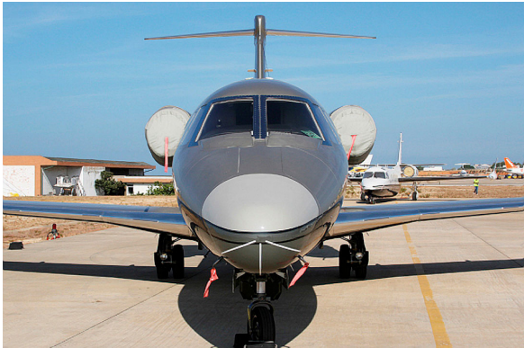
Citation III 650 Engine Covers Set

The Cessna Citation Latitude (680A) Intake/Exhaust Plugs are custom fit for the intake and exhaust openings, made with heavy-duty vinyl material, and stuffed with a single block of sculpted urethane foam. Each plug has a zipper that allows the foam to be removed and dried if necessary. Engine plugs have 'remove before flight' streamers sewn onto the face of the plugs. Most plugs are imprinted with the aircraft registration number in black. Engine plugs may be inserted after flight when the engine is still warm. Engine Inlet Plugs are commonly referred to as Cowl Plugs, Intake Plugs, Cowl Blocks, Engine Blocks, and Engine Bungs.