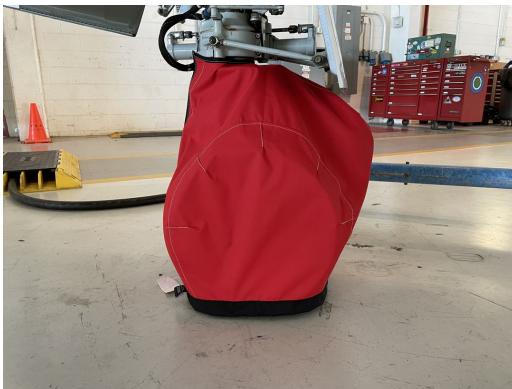
Canadair Challenger 605 Nose Gear Tire Cover