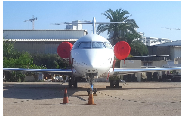
Canadair Challenger 604, 605, 650, 850 Intake Covers