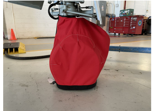
Canadair Challenger 605 Nose Gear Tire Cover