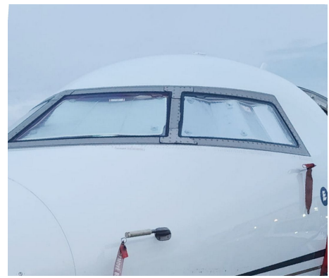
Challenger 604 Cockpit Heatshields (set of 4)