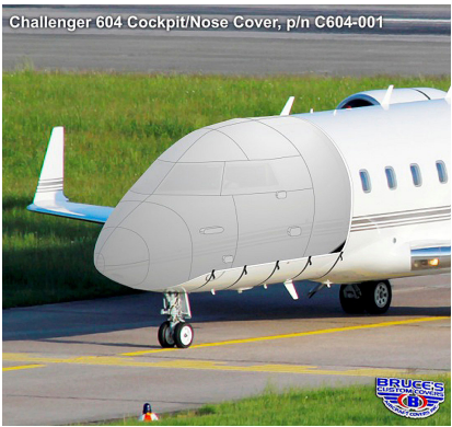
Challenger 601/604 Cockpit/Nose Cover, illustration

the hottest of days. It is water, ice and snow repellent, yet breathable to allow moisture to escape from between the cover and the aircraft surface.