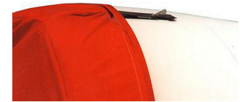
Alternate Intake Cover Design