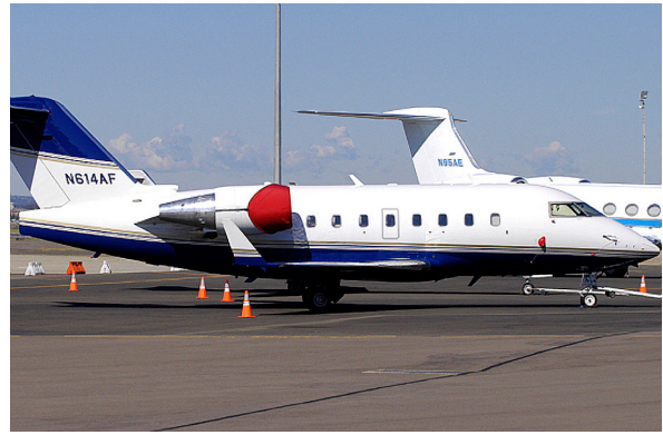
Challenger 604 Intake Covers, standard design