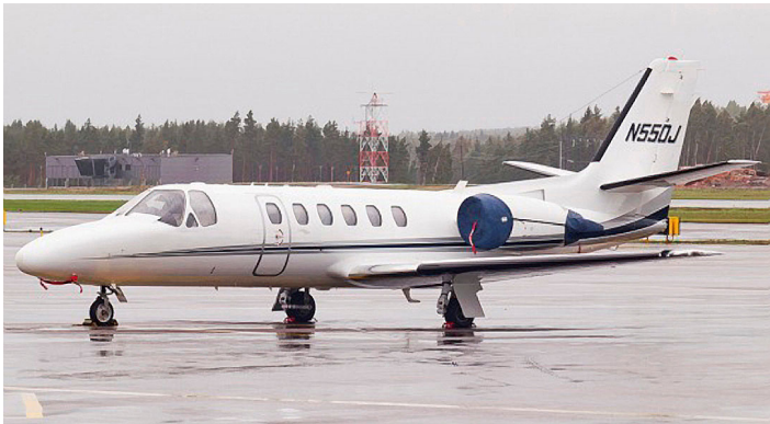
Cessna Citation Bravo Engine Covers and Pitot Covers sets

The Cessna Citationjet V Ultra & Encore Models Intake/Exhaust Plugs are custom fit for the intake and exhaust openings, made with heavy-duty vinyl material, and stuffed with a single block of sculpted urethane foam. Each plug has a zipper that allows the foam to be removed and dried if necessary. Engine plugs have 'remove before flight' streamers sewn onto the face of the plugs. Most plugs are imprinted with the aircraft registration number in black. Engine plugs may be inserted after flight when the engine is still warm. Engine Inlet Plugs are commonly referred to as Cowl Plugs, Intake Plugs, Cowl Blocks, Engine Blocks, and Engine Bungs.