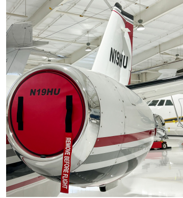
Citationjet V Ultra (560) Exhaust Plugs (set of 2)