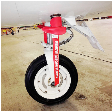
Rosemount Probe Cover