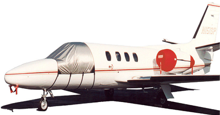
Cessna Citation Windshield, Pitot and Engine Covers