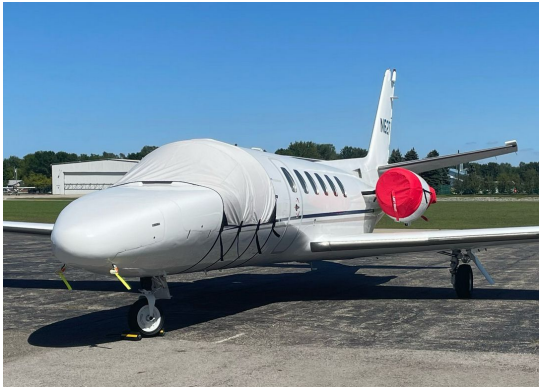
Cessna 550 Citation II