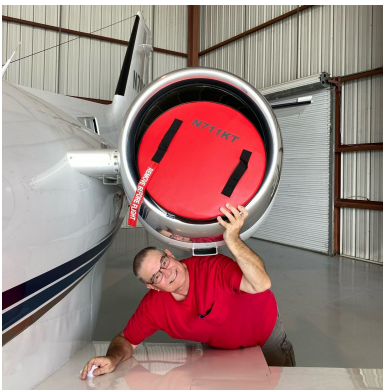
Citation II Engine Plugs

The Engine Inlet Plugs are custom fit for your Cessna Citation II (550, 551, UC-35A, with JT15D) intakes, made with heavy-duty vinyl material, and stuffed with a single block of sculpted urethane foam. Each plug has a zipper that allows the foam to be removed and dried if necessary. Engine plugs have 'remove before flight' streamers sewn onto the face of the plugs. Most plugs are imprinted with the aircraft registration number in black for an extra charge. Storage bag NOT included. Engine plugs may be inserted after flight when the engine is still warm. Engine Inlet Plugs are commonly referred to as Cowl Plugs, Intake Plugs, Cowl Blocks, Engine Blocks, and Engine Bungs.