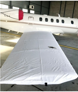
Cessna Citation CJ-4 Wing Covers, test fit cover