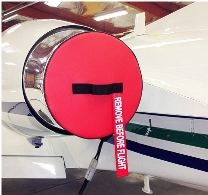
Cessna Citation S2 Exhaust Plugs