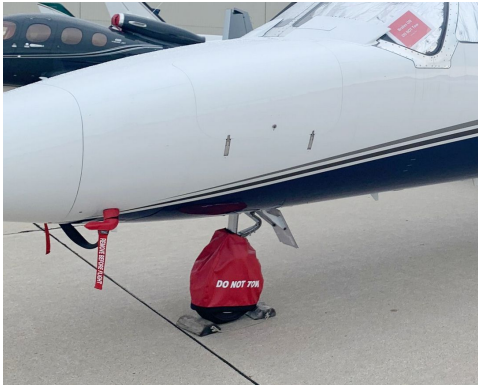
Cessna Citation Nose Tire Cover

ALL-YEAR USE MATERIAL - Made with Silver Acrylic Sunbrella canvas, the all-year use material is the best option for sun protection and cover longevity. This heavier more durable material is intended for all weather conditions, such as rain and snow or lots of sun.