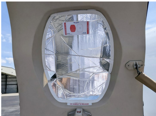
Citationjet Entrance Door Heatshield

Custom-made Heatshield Sunshades are available for almost any window in the jet. Side windows, Skylights, and Emergency Exits are all custom-made. The product is a unique composite of closed-cell foam with a silver mylar finish. The set is easily stored in the included storage sleeve. Some designs may require velcro and suction cups. Our Heatshields are offered white side out since aircraft manufacturers have issued advisories against reflective window inserts due to potential heat damage.