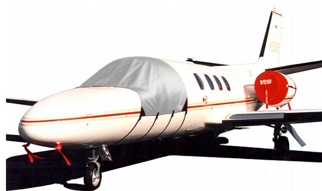
Cessna Citation Windshield Cover, Engine Cover set and Pitot Covers