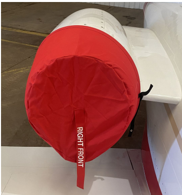
Cessna 501 Engine Covers NO TR's