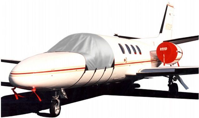
Cessna Citation Windshield Cover, Engine Cover set and Pitot Covers

The Engine Inlet Plugs are custom fit for your Cessna Citation I (500/501) intakes, made with heavy-duty vinyl material, and stuffed with a single block of sculpted urethane foam. Each plug has a zipper that allows the foam to be removed and dried if necessary. Engine plugs have 'remove before flight' streamers sewn onto the face of the plugs. Most plugs are imprinted with the aircraft registration number in black for an extra charge. Storage bag NOT included. Engine plugs may be inserted after flight when the engine is still warm. Engine Inlet Plugs are commonly referred to as Cowl Plugs, Intake Plugs, Cowl Blocks, Engine Blocks, and Engine Bungs.