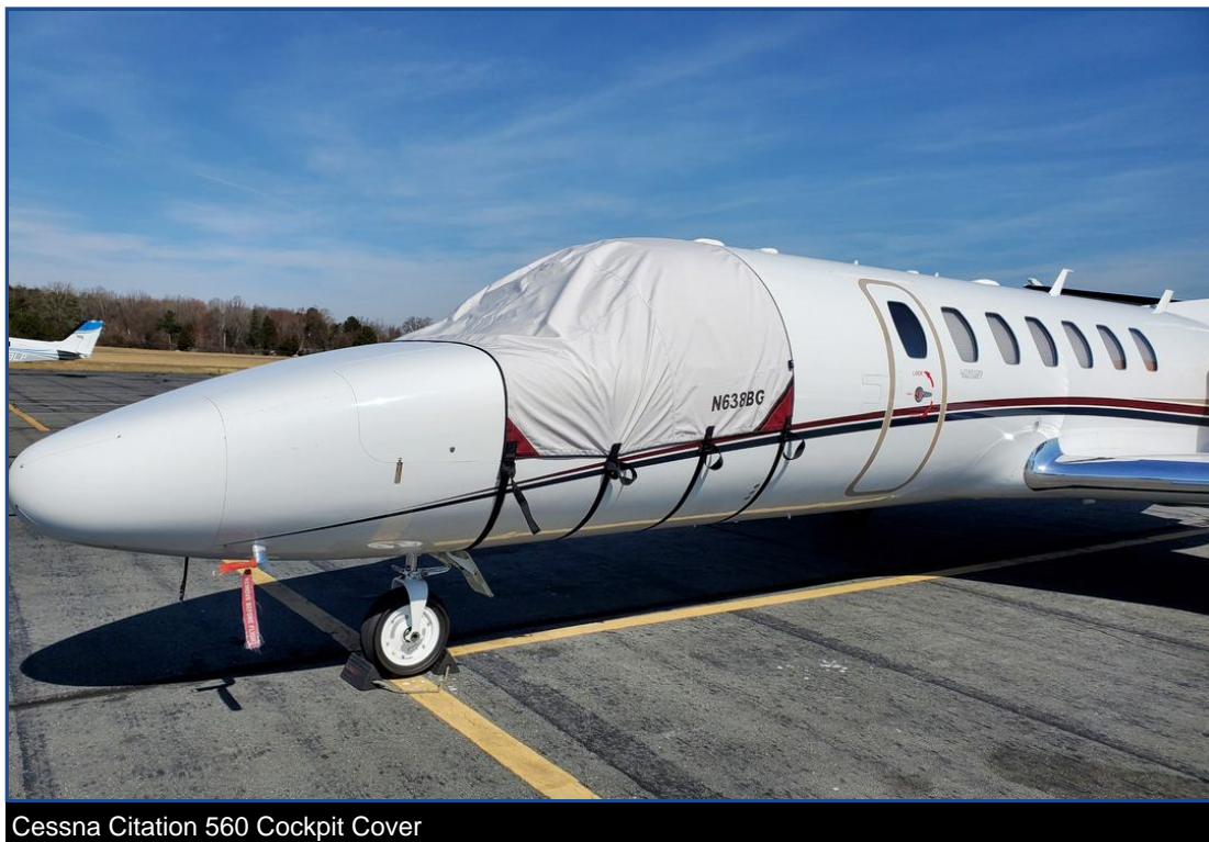
Cessna Citation 560 Cockpit Cover