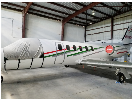
Cessna Citation II Cockpit Cover, Wing Covers

This cover type is made from Silver Acrylic Sunbrella canvas and is 100% lined with a soft and smooth microfiber. Bruce's Custom Covers developed this material combination especially for aircraft protection. The outer material is medium weight and treated for water resistance, UV resistance and anti-static buildup. The inner lining is a very soft and smooth microfiber to prevent scratching. The material is very reflective, and tests show that the cabin interior temperature can be reduced to near-ambient temperature on the hottest of days. It is water, ice and snow repellent, yet breathable to allow moisture to escape from between the cover and the aircraft surface.