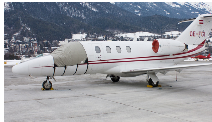
Cessna Citationjet CJ1 Cockpit Cover

Travel Covers are made with Silver Solution-Dyed Polyester fabric and only lined over the windshield to save weight. The material is lightweight and more compact for easy stowage in the aircraft. The polyester material is water resistant, but only intended for occasional use outside. We also have an ultra lightweight material available for fitted hangar dust covers. For daily outdoor use, the non-travel Sunbrella Cover is the best choice.