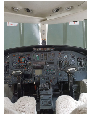
Cessna Citation I & II Cockpit HeatShields