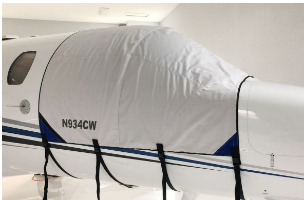
Cessna Citation M2 Cockpit Cover