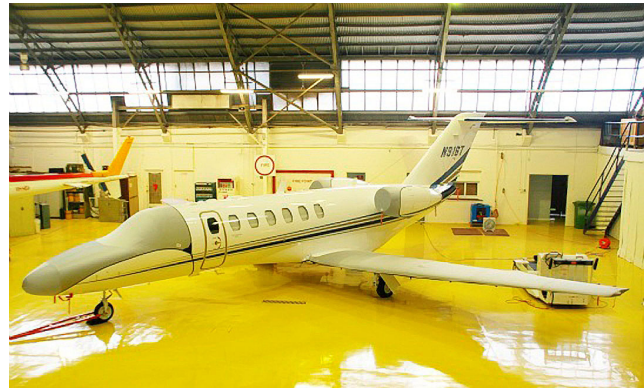
Cessna Citationjet CJ3 Cockpit/Nose, Engine & Wings Travel Covers