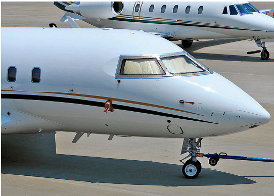
Challenger 604 Cockpit HeatShields