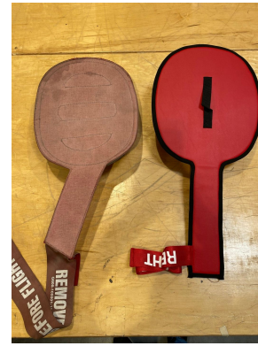
Canadair Challenger 300, 350 Heat Exchanger Exhaust Plug