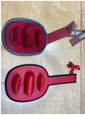
Canadair Challenger 300, 350 Heat Exchanger Exhaust Plug