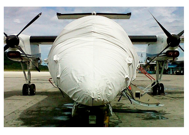
De Havilland Dash 8 Cockpit/Nose Cover