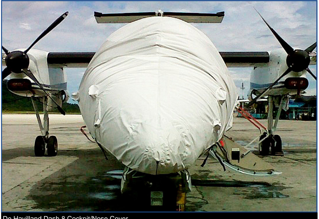
De Havilland Dash 8 Cockpit/Nose Cover