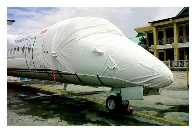
De Havilland Dash 8 Cockpit/Nose Cover

This cover type is made from Silver Acrylic Sunbrella canvas and is 100% lined with a soft and smooth microfiber. Bruce's Custom Covers developed this material combination especially for aircraft protection. The outer material is medium weight and treated for water resistance, UV resistance and anti-static buildup. The inner lining is a very soft and smooth microfiber to prevent scratching. The material is very reflective, and tests show that the cabin interior temperature can be reduced to near-ambient temperature on the hottest of days. It is water, ice and snow repellent, yet breathable to allow moisture to escape from between the cover and the aircraft surface.