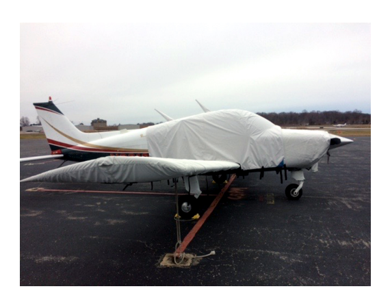
Beech Sundowner Extended Canopy Cover, Engine, and Wing Covers