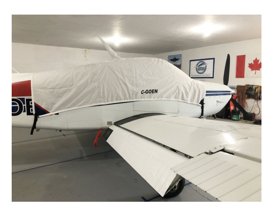
Beech Sierra B24R Canopy Cover