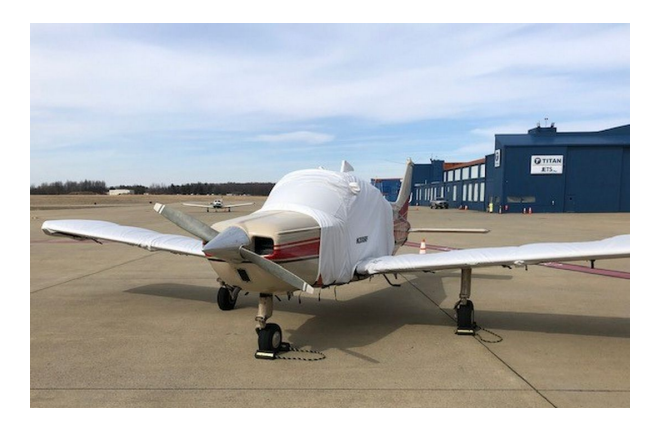
Beech C23 Extended Canopy Cover, Wing Covers